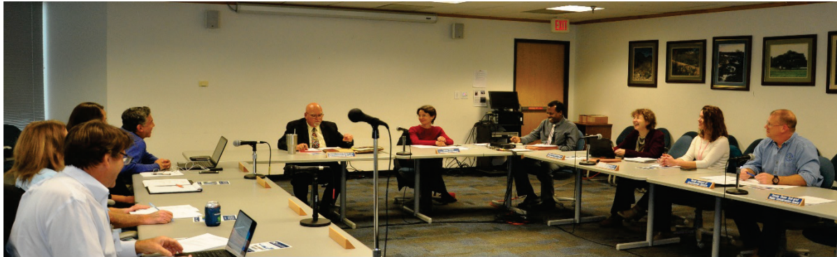
Texas Groundwater Protection Committee Quarterly Meeting in Austin, Texas, October 2018.

Periodically, state laws are enacted that require the TGPC to undertake rulemaking. Much of the TGPC's work is performed in quarterly meetings and through the efforts of its subcommittees.