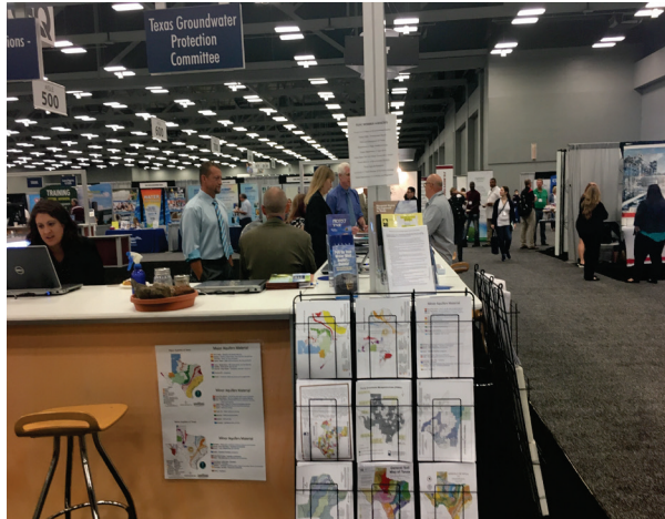
TGPC exhibit booth at the TCEQ Environmental Trade Fair in Austin, May 2018.

During 2017 and the first half of 2018, the TGPC continued its sponsorship of exhibitor booths and displays at 11 Austin-area conferences, seminars, and meetings with an estimated 4,879 visitors (estimated as ten percent of registered attendees). From its exhibitor booth, the TGPC distributed its trifold brochure, hydrogeological maps, fact sheets, booklets, and links to downloadable groundwater publications at TGPC and other websites. In March of 2017 and 2018, a TGPC-sponsored poster for National Groundwater Awareness Week was displayed in a dozen central Texas locations, including the Texas Capitol.