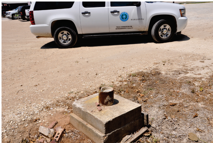
Abandoned, deteriorated, and unplugged water well in an open parking lot near Salado, Texas, June 2018.

Abandoned and deteriorated water wells exist in every county of the state. These wells top of the list of potential groundwater contamination sources landowners can find and eliminate. State law requires landowners or persons who possess an abandoned and/or deteriorated water well to repair, plug or cap it under TDLR rules. The TDLR has the authority to assess administrative and civil penalties for non-compliance. However, these rules can be a financial burden and provide no incentive. Educational efforts, such as the TGPC’s Landowner’s Guide to Plugging Abandoned Water Wells (TCEQ, 2010) can help land-owners plug their own water