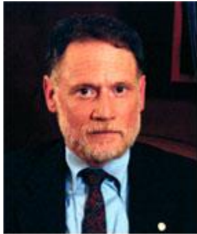
Daniel J. Dunmire, Director, DoD Office of Corrosion Policy and Oversight

A roadmap to help federal, state, and local officials tackle infrastructure corrosion is currently in place. But the process for implementing this model is very different from the framework the U.S. Department of Defense (DoD) uses to fight corrosion on our military weapon systems.