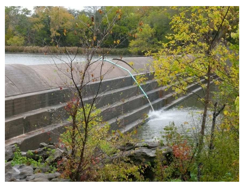
Photograph 3. Springfield Lake at Dam with City Siphon

Based on the City of Groesbeck's water right, the city siphons water from Springfield lake during low flow periods in the Navasota River (below Lake Mexia). Typically the low flow periods result in water ceasing to flow over the Springfield Lake dam. An example of the City' of Groesbeck's siphon is shown in Photograph 3.