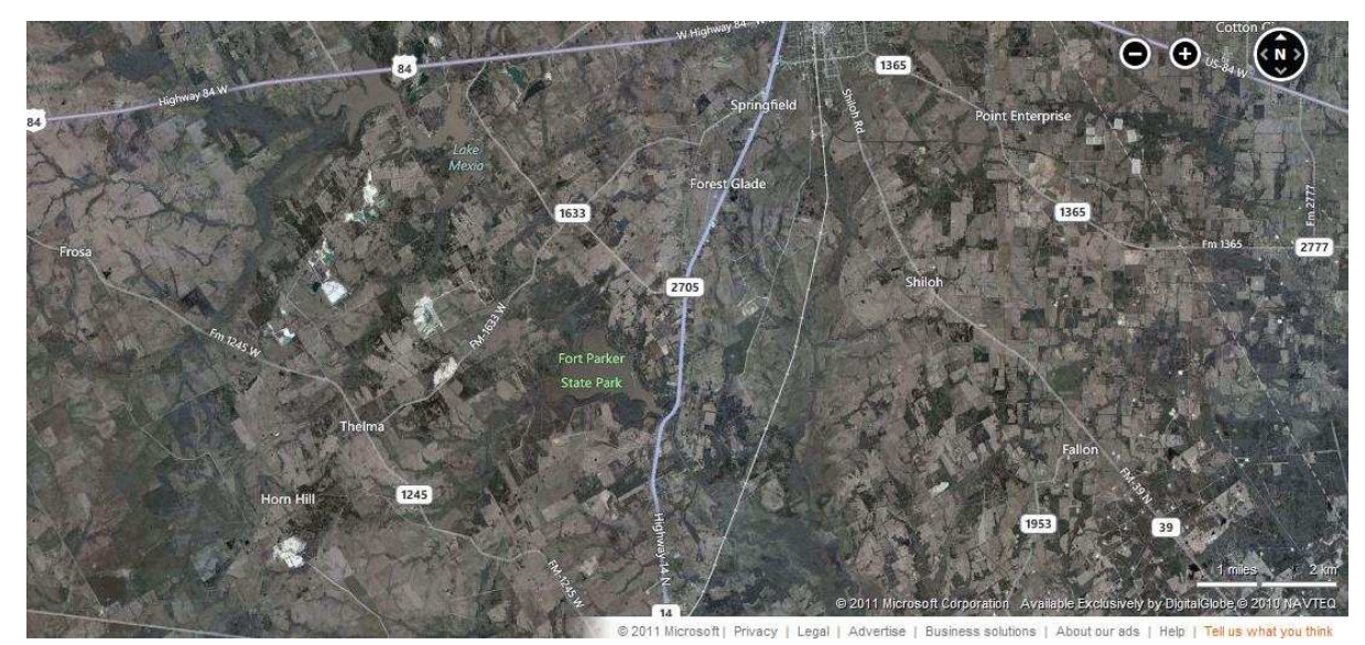
Figure 1. General Location Map

Figure 1 shows the general location map of the Lake.