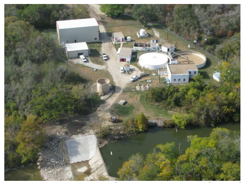
Photograph 2. Water Treatment Plant on Navasota River with City Dam

The City of Groesbeck has water rights on the Navasota River with a priority date of June 1921 (Certificate of Adjudication No. 12-5289). According to the Brazos G Regional Water Plan, the City has one of the most senior water rights in the Brazos River Basin. The City's water right allows for a diversion of 2,500 ac-ft/yr_(or 2.23 MGD on equivalent average daily basis). The right includes storage of 500 ac-ft (163 MG). The maximum diversion rate is 3.56 cfs (1,600 gpm). The City's dam on the Navasota River is shown in Photograph 2.