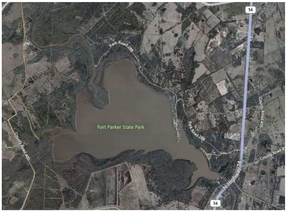
Figure 2. Springfield Lake Site Map

Since the lake is shallow, it is extremely sensitive to low rainfall periods. In spite of the last dredging project, the sediment build up in the reservoir is apparent. Photograph 1 shows the Springfield Lake at the mouth of the Navasota River with the sediment build-up apparent in the reservoir.