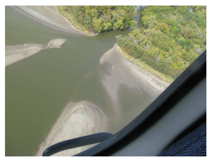
Photograph 1. Springfield Lake at feed point from Navasota River (November 11, 2011)

The City of Groesbeck has water rights on the Navasota River with a priority date of June 1921 (Certificate of Adjudication No. 12-5289). According to the Brazos G Regional Water Plan, the City has one of the most senior water rights in the Brazos River Basin. The City's water right allows for a diversion of 2,500 ac-ft/yr_(or 2.23 MGD on equivalent average daily basis). The right includes storage of 500 ac-ft (163 MG). The maximum diversion rate is 3.56 cfs (1,600 gpm). The City's dam on the Navasota River is shown in Photograph 2.