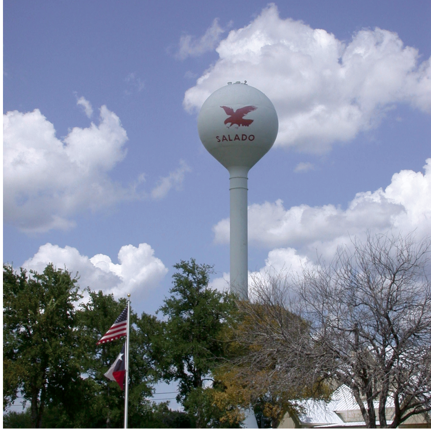
City of Salado Water Tower