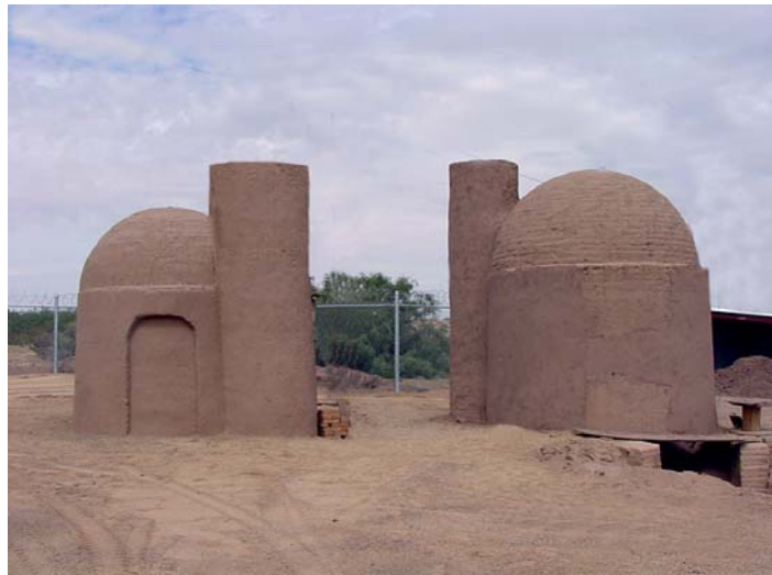
Figure 4: Marquez Kiln