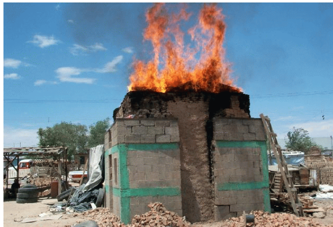
Figure 3: Final Firing Stage of an Unmodified Brick Kiln