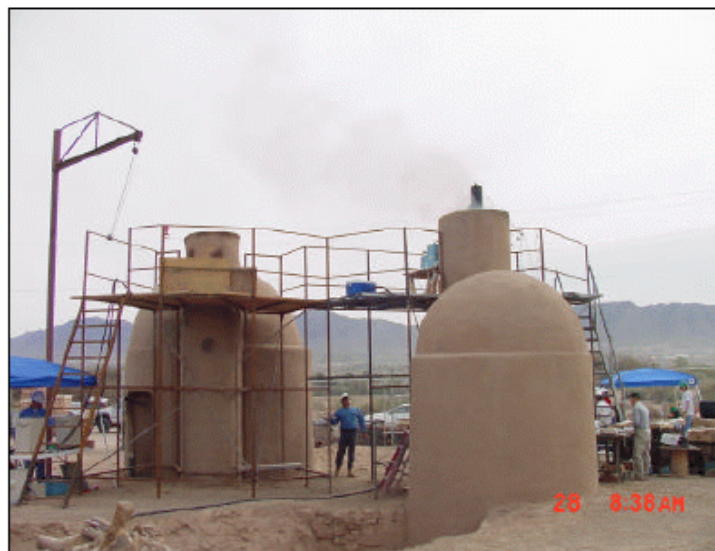
Figure 5: Marquez Kiln during Burn