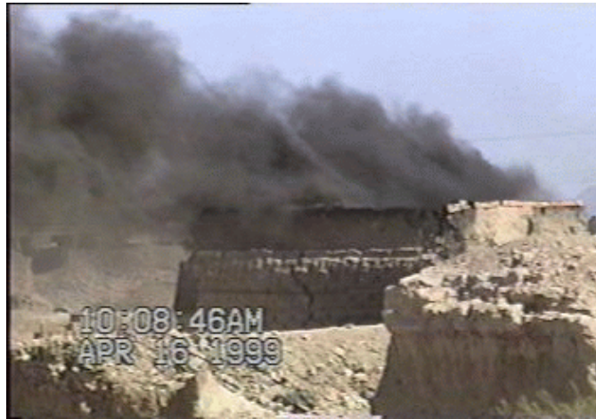
Figure 2: Unmodified Brick Kiln