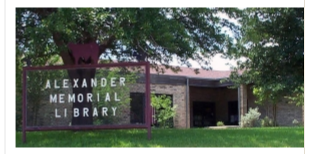
Alexander Memorial Library

Connect to: Library Web Site ✓ Online Catalog