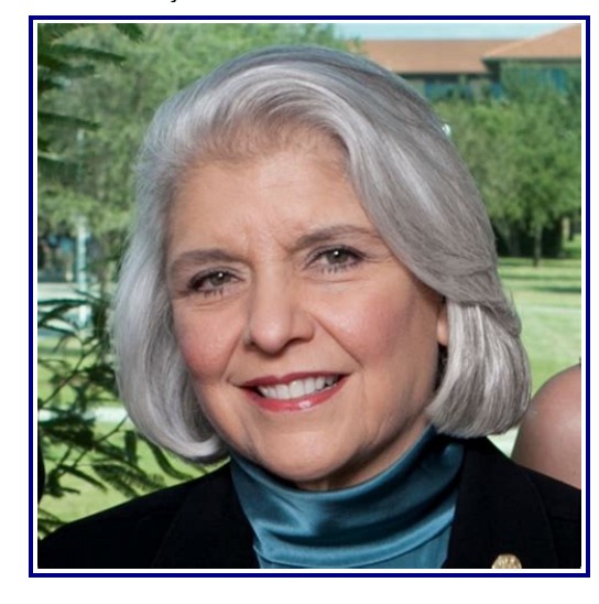
♣ Add to Favorites (/online/add_favorite/? name=Sen. Judith Zaffirini)