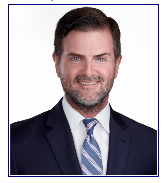
★ Add to Favorites (/online/add_favorite/? name=Sen. Brandon Creighton)