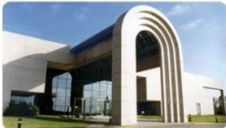
George Memorial Library

Updates: Corrections or Updates? Registered members of Library Technology Guides can submit updates to library listings in libraries.org. Registration is free and easy.