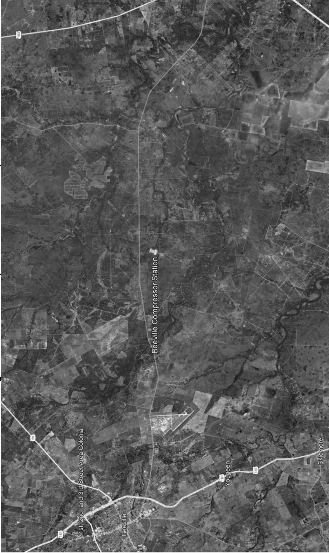
Figure 1.1 – Beeville Compressor Station Area Map