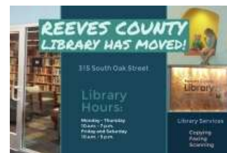
Reeves County Library