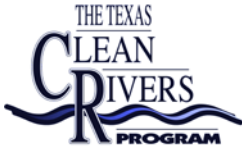
Exhibit 3B Coordinated Monitoring Meeting Summary of Changes