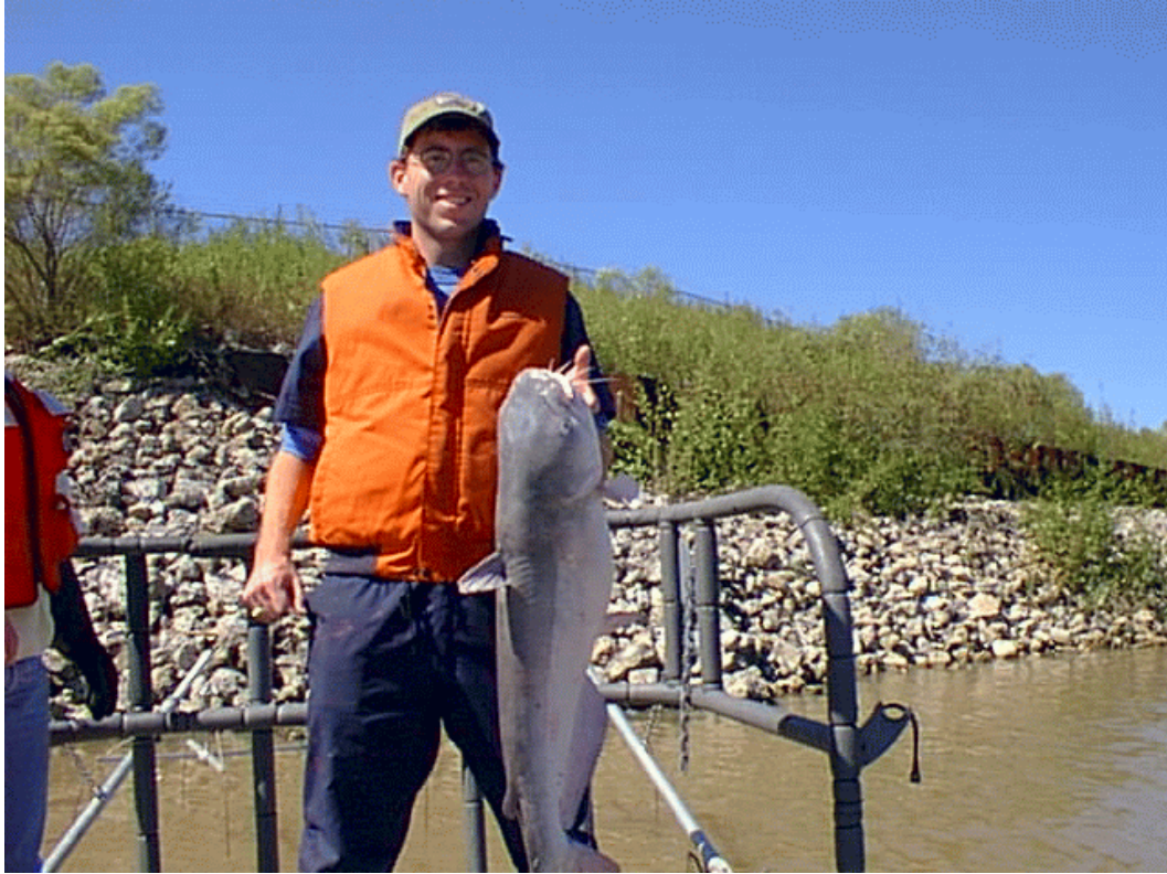
Collecting Large Fish During Tissue Study