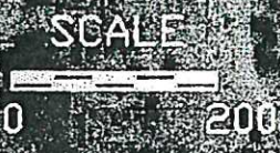
FIGURE 4 / CROSS-SECTION MAP FLOODPLAIN IMPACT ANALYSIS & FLOODPLAIN DEVELOPMENT PERMIT APPLICATION 251 LANDONS WAY, SPRING BRANCH, TX.