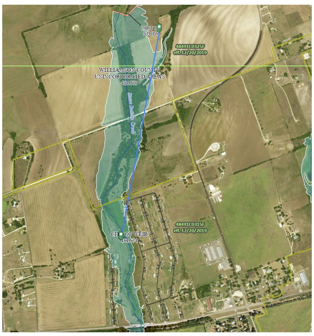
Attachment B Snip of the FEMA Nation Flood Hazard Layer FIRMette depicting approximate the location of the proposed facility in relation to the Weir water well