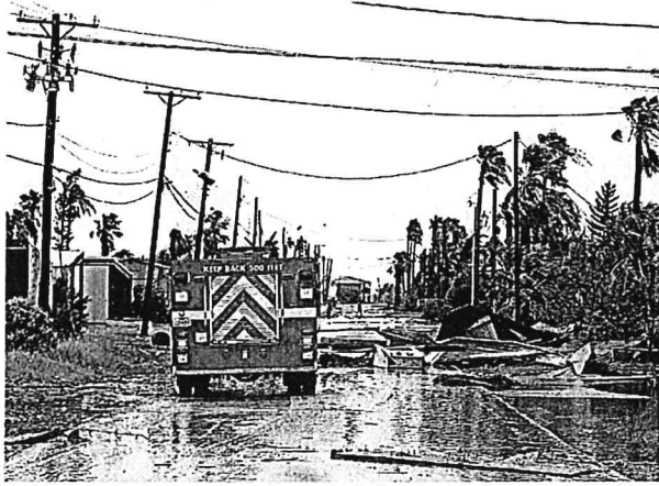
The Port Aransas Fire Department surveys the area after Hurricane Harvey landed in the Coastal Bend on Aug. 26, 2017.

Valero Refining-Texas, L.P., has applied to the Texas Commission on Environmental Quality (TCEQ) for an amendment to and renewal of State Air Quality Permit Number 2937 and modification to Prevention of Significant Deterioration (PSD) Air Quality Permit Number PSDTX1023M3, which would authorize modifications to and continued operation of the Bill Greehey Refinery East Plant located at 1300 Cantwell Lane, Corpus Christi, Nueces County, Texas 78407. Additional information concerning this application is contained in the public notice section of this newspaper.