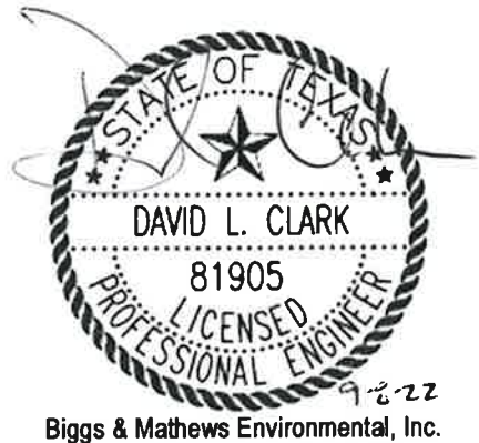
Firm Registration No. F-256