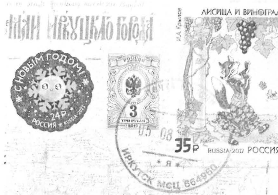
Colorful and interesting stamps and postmark from Irkutsk, Siberia.

The statistical successes of Postcrossing are staggering: 802,888 members in 208 countries have received 68,218,754 postcards traveling 213,598,125,186 miles. It