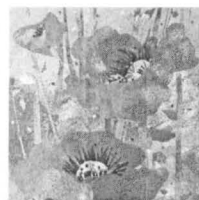
An example of red poppy art used for the poster contest.

Additional submission guidelines, as well as online submission forms, are available at https://artsgeorgetown.submittable.com/submit/237304/2023-georgetown-red-poppy-festival-call-for-poster-art .