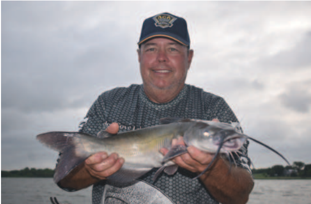
Channel catfish are in shallow water during early morning now, feeding on shad. Lake Tawakoni catfish guide just caught a nice one!

the game fish and shad will be concentrated. This bite will be going strong for the next several weeks on most all of our lakes. I usually plan an overnight stay at Wind Point Park on Lake Tawakoni so that I will be there ready to fish at first light but if you’re a very early riser and close to the waters you plan to fish, an early morning drive is another option. The trick is to fish the first couple hours of daylight.