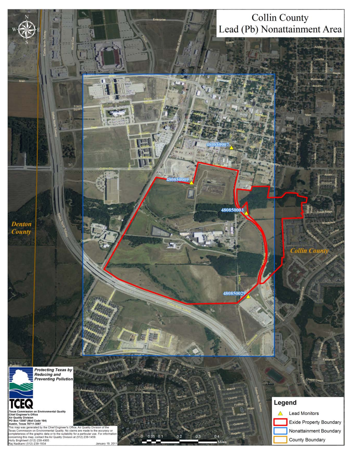
Figure 4-1: Collin County Lead (Pb) Nonattainment Area