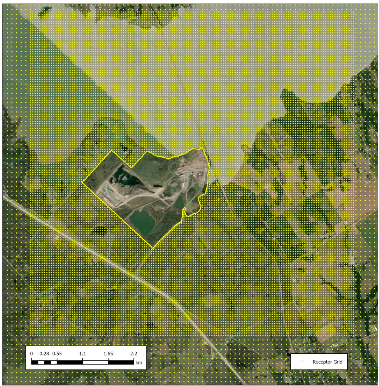
Figure 5-2: Innermost Receptor Grid