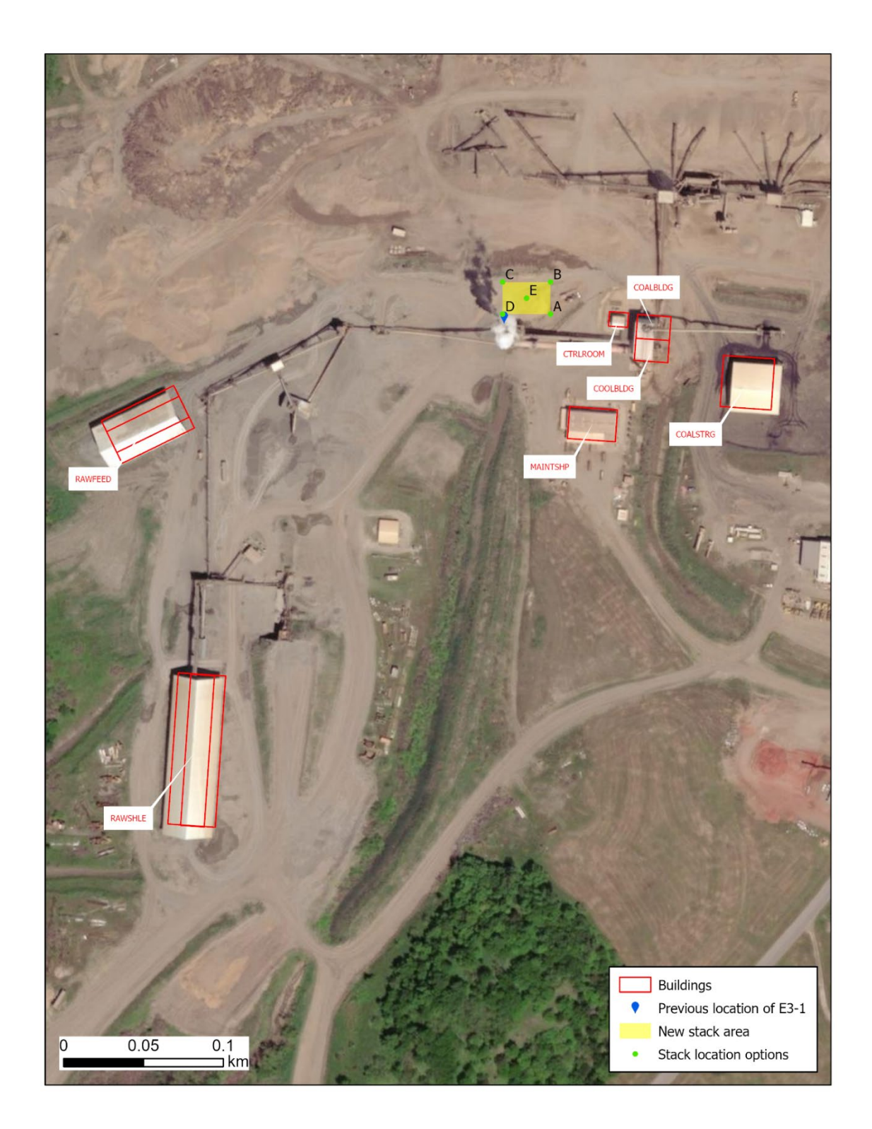
Figure 3-2: Streetman Plant Site Layout