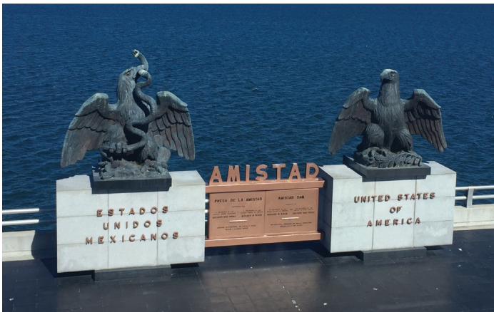
Statues of a golden eagle and a bald eagle mark the international border at the Amistad Dam in West Texas, the largest of the two binational reservoirs on the Rio Grande.