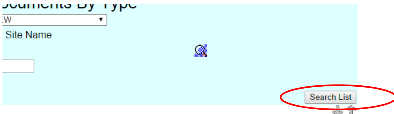
Figure 4 - Search List