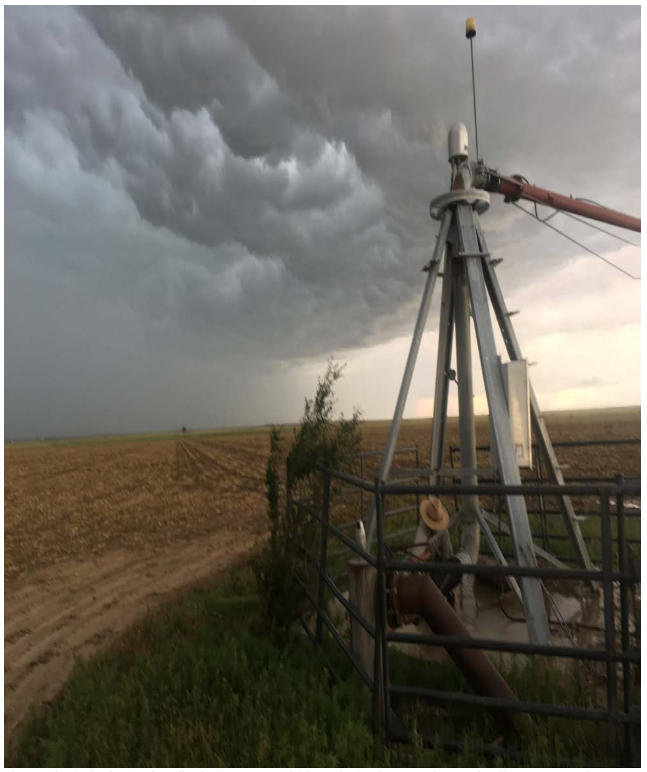
Plenty of rain in the Panhandle during 2019. TCEQ geologist Scott Underwood collects a groundwater sample for pesticide analysis from a center pivot located north of Texline, Texas, June 2019.