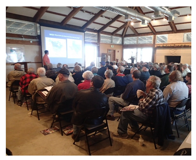
Texas A&M AgriLife Extension Service staff deliver a presentation at a Texas Well Owner Network educational event.

During 2019 and the first half of 2020, the TGPC continued its sponsorship of exhibitor booths and displays at 11 Austin-area conferences, seminars, and meetings with an estimated 3,784 visitors (estimated as ten percent of registered attendees). From its exhibitor booth, the TGPC distributed its trifold brochure, hydrogeological maps, fact sheets, booklets, and links to downloadable groundwater publications at TGPC and other websites. In March of 2019 and 2020, a TGPC-sponsored poster for National Groundwater Awareness Week was displayed in a dozen central Texas locations, including the Texas Capitol.