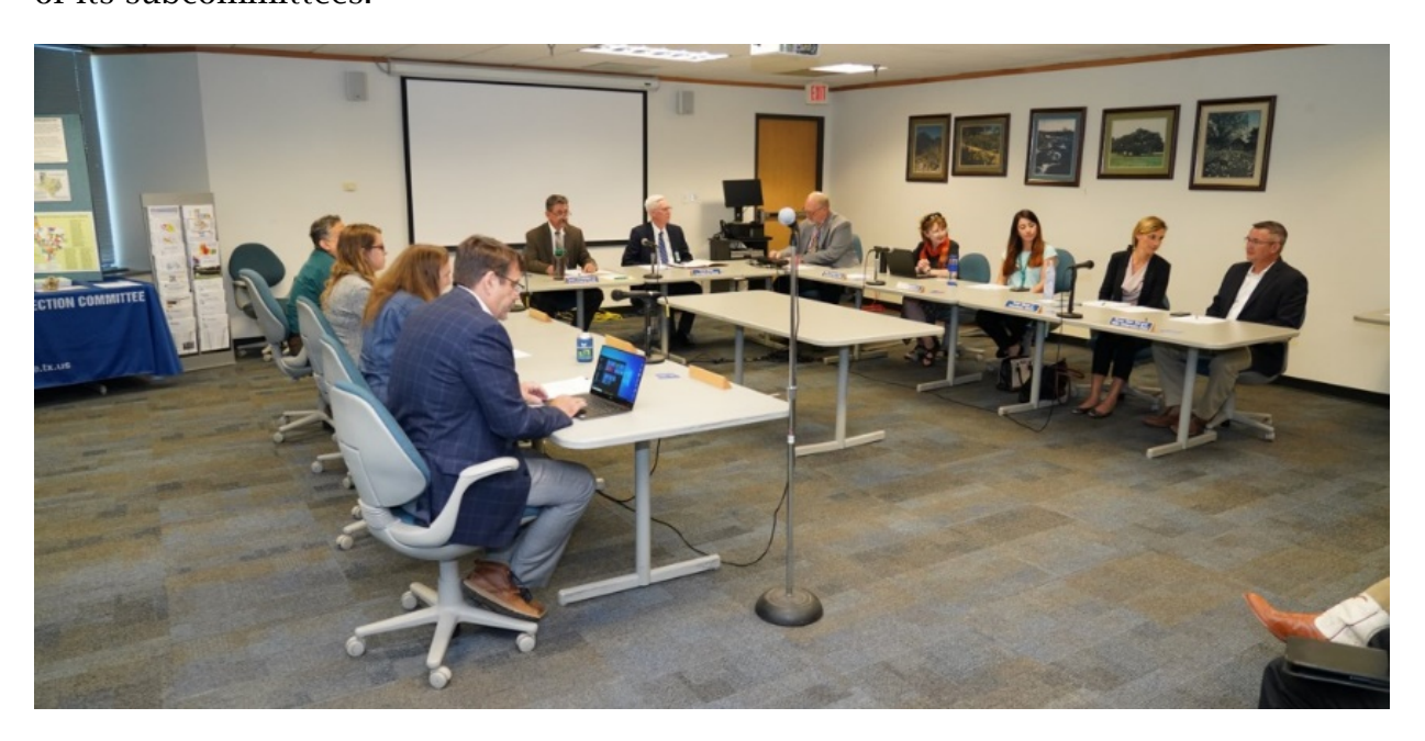
Texas Groundwater Protection Committee Quarterly Meeting in Austin, Texas, October 2019.

Periodically, state laws are enacted that require the TGPC to undertake rulemaking. Much of the TGPC's work is performed in quarterly meetings and through the efforts of its subcommittees.