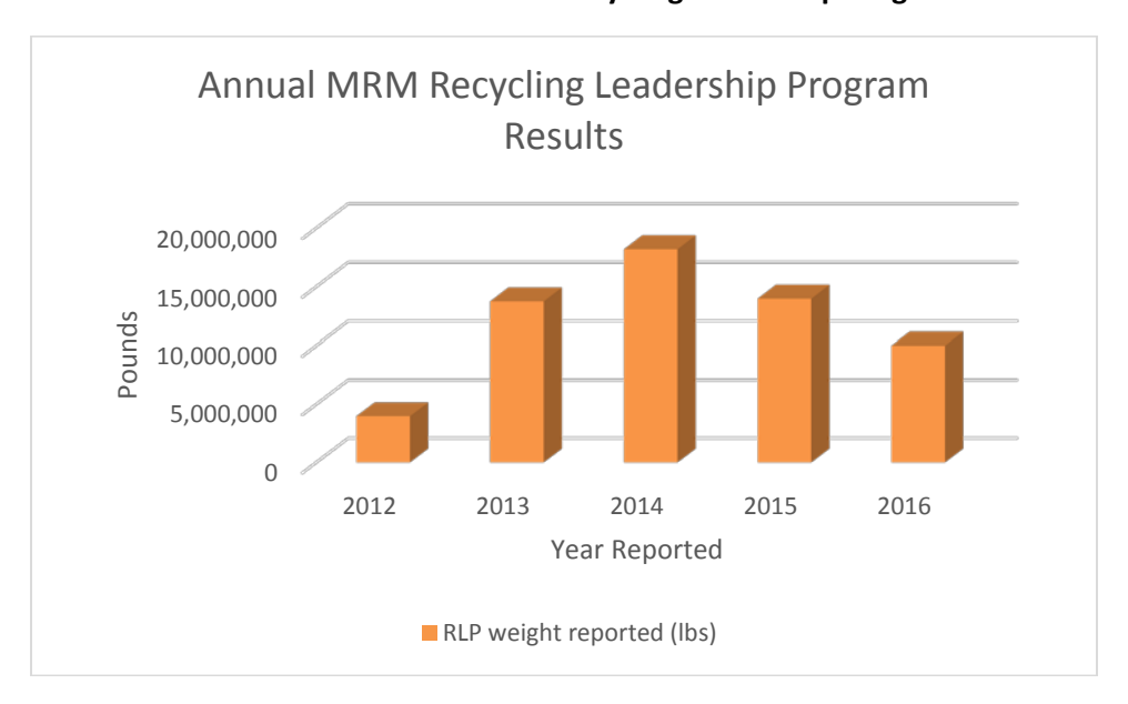
Chart 4. MRM Manufacturer Recycling Leadership Program

In 2016, there was one recycling leadership program with 14 manufacturers that was operated by MRM Manufacturer RLP. The RLP submitted their required biennial report at the beginning of 2017 with recycling information provided for the previous two years of operation, 2015 and 2016. The manufacturers participating in the RLP recycled 13,973,000 pounds in 2015 and 9,990,000 pounds in 2016. This information is shown graphically in Chart 4 .