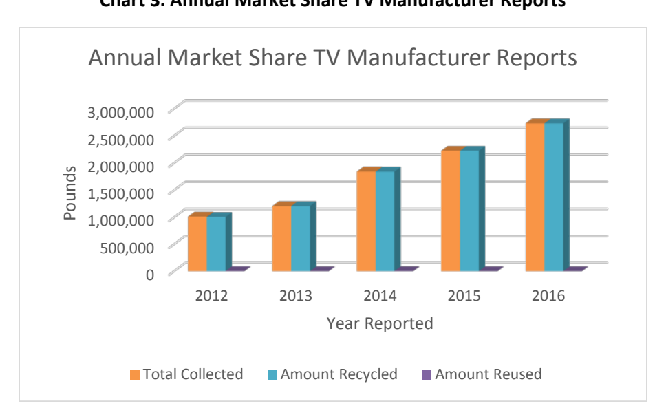
Chart 3. Annual Market Share TV Manufacturer Reports

Chart 3 shows the weights reported as being collected by manufacturers that chose to participate under the market share option.