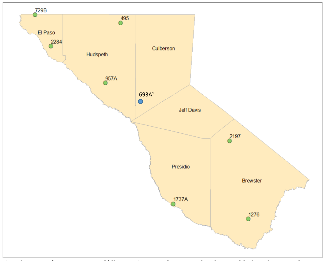
1) The City of Van Horn Landfill (693A), opened in 2020, has been added to the map above.