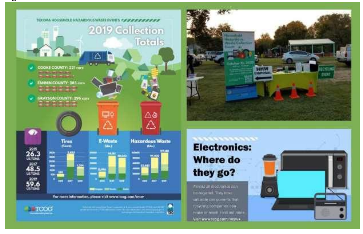
Figure 3.2. HHW Collection Event Print Materials and Events