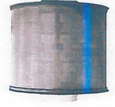
Self-Cleaning Strainers | Sure-Flo Fittings