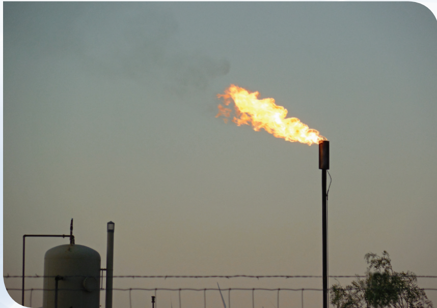
This is an example of a normally-operating oil and gas flare at a distance. Note that a small amount of smoke may be evident.