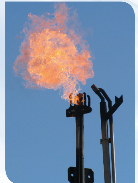
This is an example of an air-assisted flare effectively burning and destroying excess waste gas and achieving high efficiency. Notice the flame.