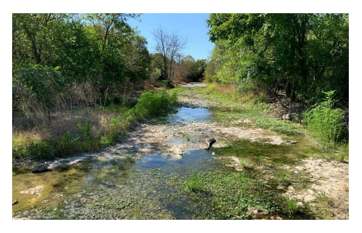
Drought has affected many of the streams in the Brazos River Basin. On the left, a Brazos photo taken in Summer 2015. At right, the same location, but Summer 2022. With the limited flow in 2022, vegetation has had the opportunity to grow in the silt and sand accumulated in the stream bed.

TCEQ is engaged to respond to drought. The agency's drought response includes monitoring conditions across the state, expedited processing of drought-related water rights applications, responding to priority calls, and participating in multi-disciplinary task force meetings.