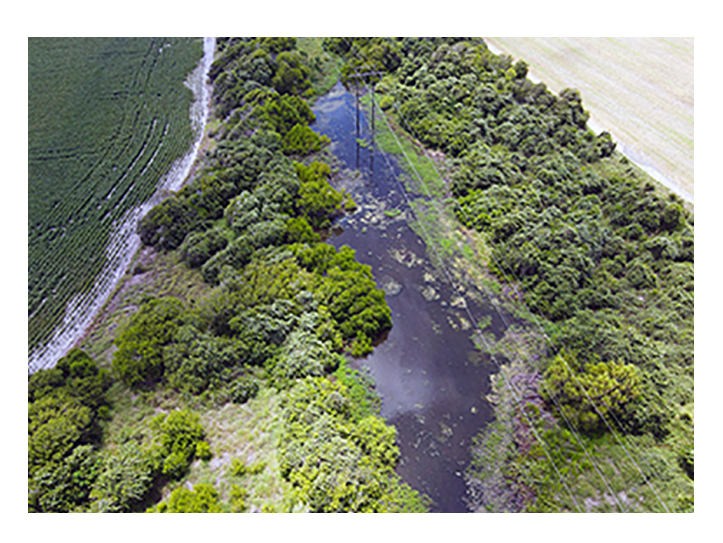
Drones give investigators a way to protect public safety while also keeping themselves out of harm's way. Above, a drone captured this photo of a previously unknown freshwater impoundment not readily accessible. Below, a view of a warehouse fire in Houston taken by a drone.