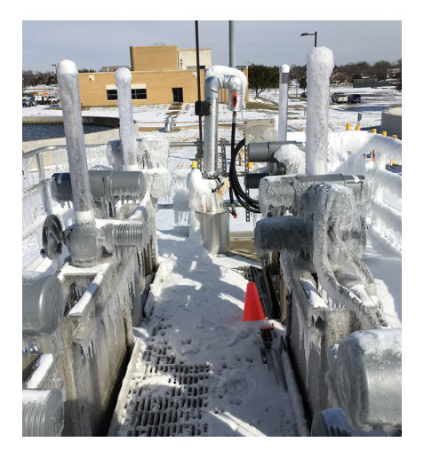
Winter Storm Uri wreaked havoc on public water systems—from broken mains to frozen equipment—causing 1,985 systems to issue boil water notices.