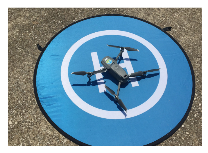
TCEQ now uses drones to augment manned aircraft during investigations.

The crux of TCEQ's position is that eight-hour ozone concentrations in El Paso include international