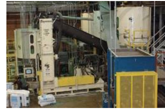
Manufacturing advancements have gone hand-in-hand with advancements in Conwed Fibers' ingredients and mulch performance.

Conwed Fibers set the standard for erosion control excellence when it began operations in 1965. Our wood-fiber hydraulic mulch stood head and shoulders above all other mulches at that time, and it still does. Continual research, thorough testing at leading universities, and the commitment to remain the premium mulch producer has kept Conwed Fibers on top of the competition for all of these years. And now we've introduced the first wood and blended products with a new flocculating agent that takes hydraulic mulch performance to an even higher level.