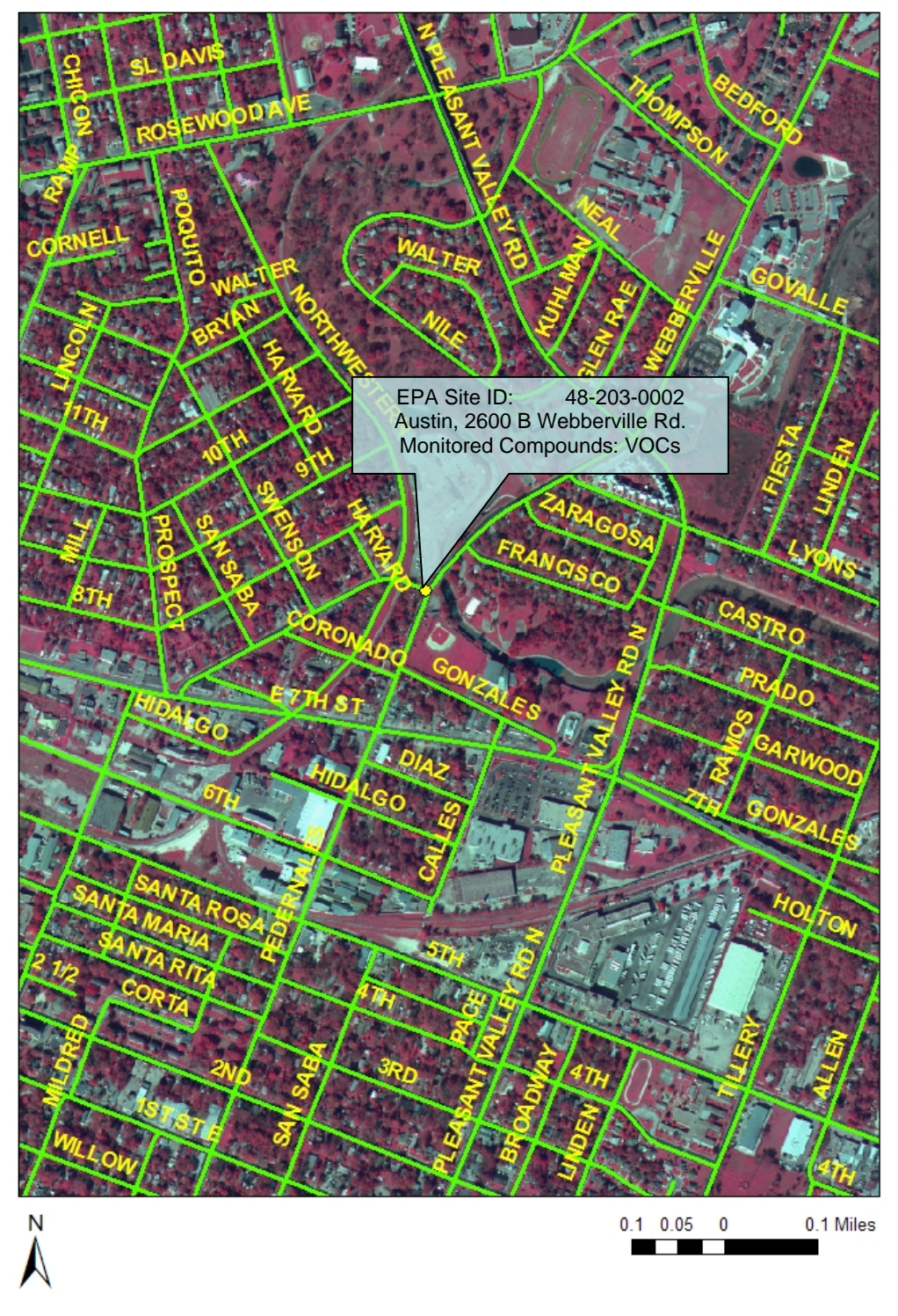
Figure 1. Location of Austin Webberville Road Monitor