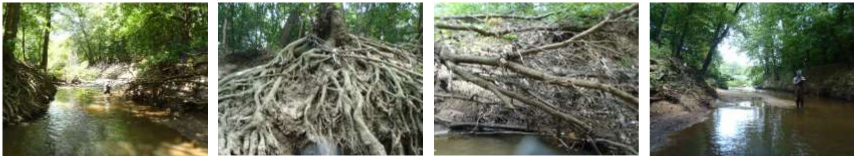
Photo group 4a: Site BF04 at 0m; downstream, left bank, right bank, upstream. Taken on trip 1, 08/03/2020.