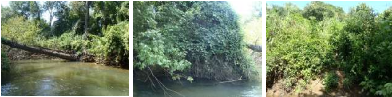
Photo group 1a: Site BF01 at 0m; downstream, left bank, right bank. Taken on trip 1, 08/03/2020.