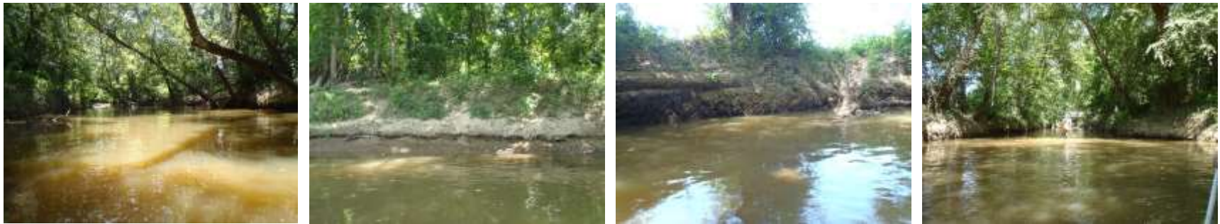
Photo group 2a: Site BF02 at 0m; downstream, left bank, right bank, upstream. Taken on trip 1, 08/03/2020.