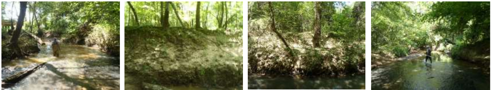
Photo group 2b: Site BF02 at 150m; downstream, left bank, right bank, upstream. Taken on trip 1, 08/03/2020.