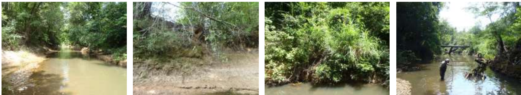
Photo group 6c: Site BF06 at 300m; downstream, left bank, right bank, upstream. Taken on trip 1, 08/03/2020.