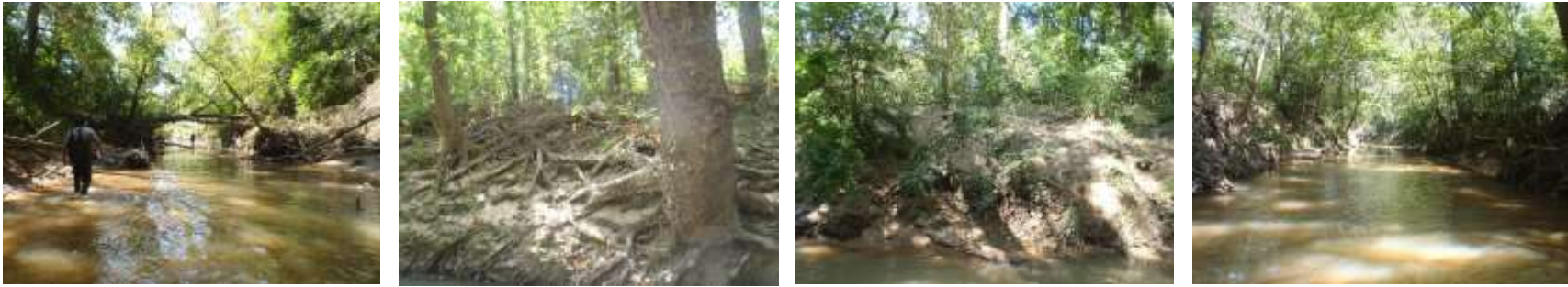
Photo group 4c: Site BF04 at 300m; downstream, left bank, right bank, upstream. Taken on trip 2, 10/06/2020.