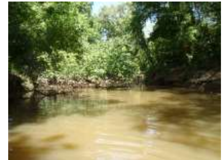
Photo group 3a: Site BF03 at 0m; downstream, left bank, right bank, upstream. Taken on trip 1, 08/03/2020.