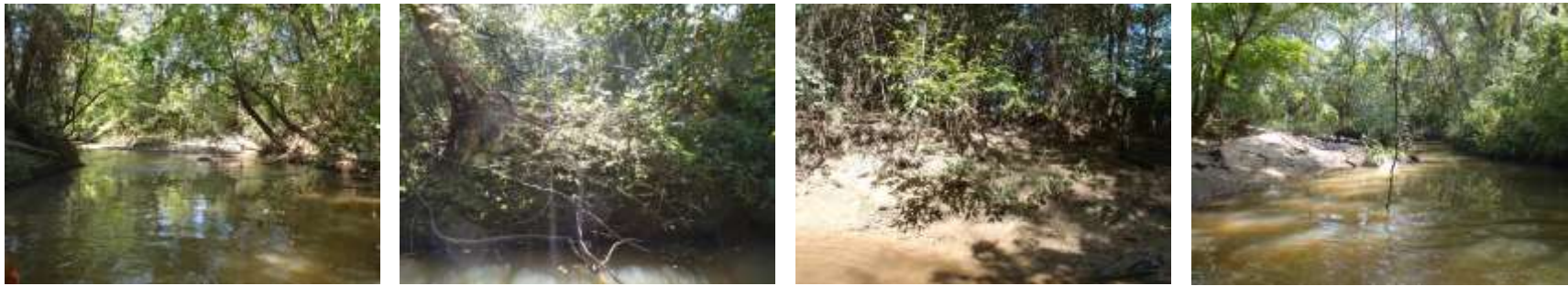
Photo group 2c: Site BF02 at 300m; downstream, left bank, right bank, upstream. Taken on trip 2, 10/06/2020.