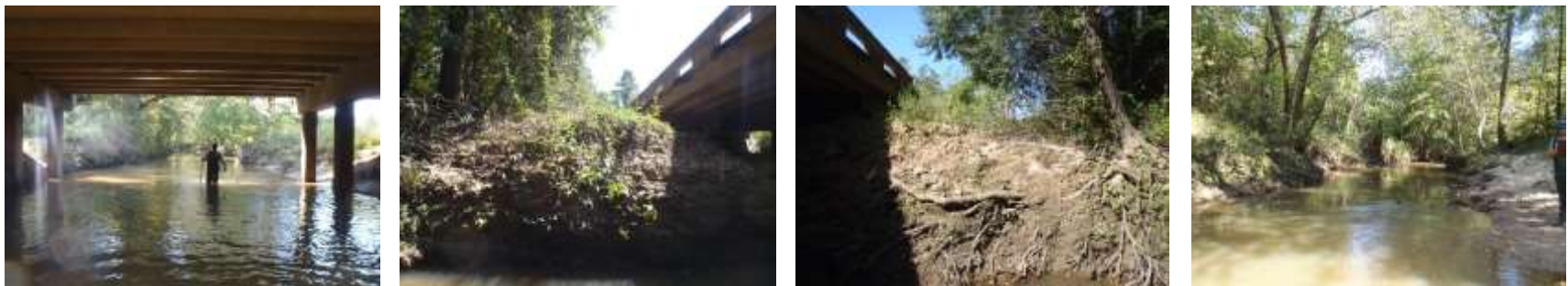
Photo group 2b: Site BF02 at 150m; downstream, left bank, right bank, upstream. Taken on trip 2, 10/06/2020.