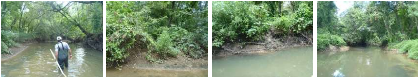
Photo group 1c: Site BF01 at 300m; downstream, left bank, right bank, upstream. Taken on trip 1, 08/03/2020.