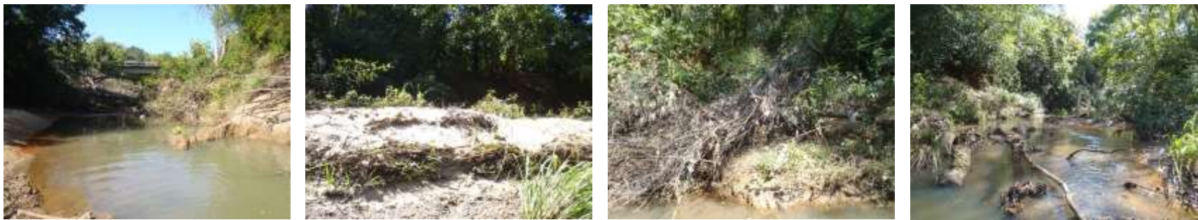
Photo group 6a: Site BF06 at 0m; downstream, left bank, right bank, upstream. Taken on trip 2, 10/06/2020.