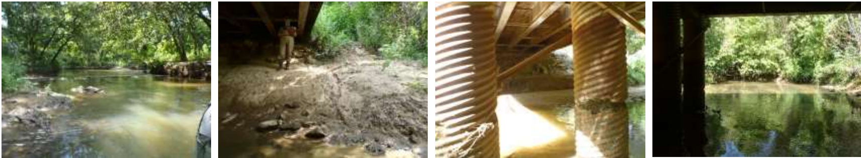
Photo group 1b: Site BF01 at 150m; downstream, left bank, right bank, upstream. Taken on trip 1, 08/03/2020.