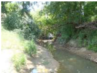
Photo group 5d: Site BF05; tributary. Taken on trip 1, 08/03/2020.