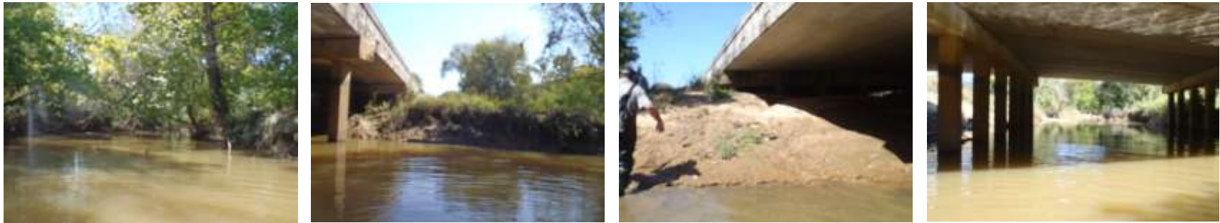
Photo group 3c: Site BF03 at 300m; downstream, left bank, right bank, upstream. Taken on trip 2, 10/06/2020.