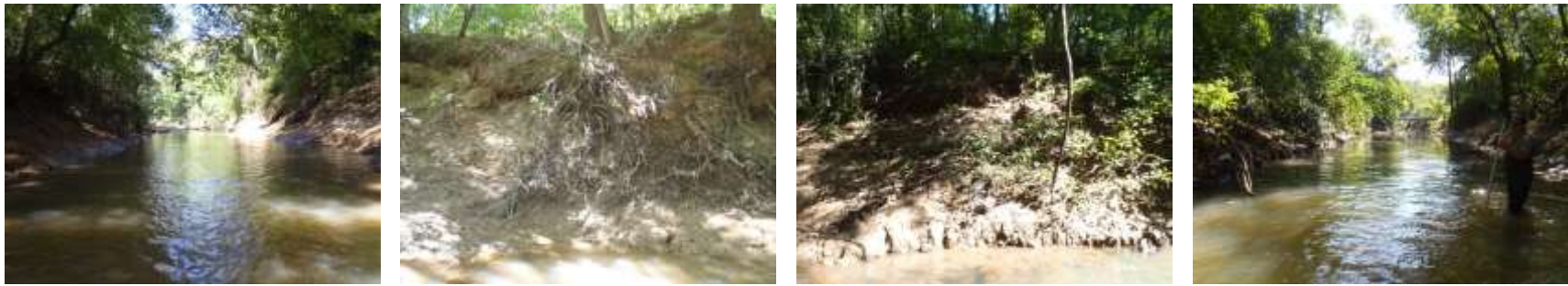
Photo group 6b: Site BF06 at 150m; downstream, left bank, right bank, upstream. Taken on trip 2, 10/06/2020.