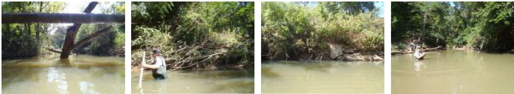
Photo group 6c: Site BF06 at 300m; downstream, left bank, right bank, upstream. Taken on trip 2, 10/06/2020.