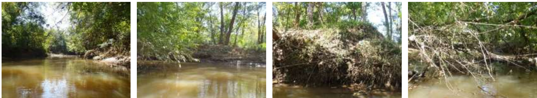
Photo group 3b: Site BF03 at 150m; downstream, left bank, right bank, upstream. Taken on trip 2, 10/06/2020.