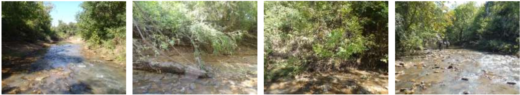
Photo group 5b: Site BF05 at 150m; downstream, left bank, right bank, upstream. Taken on trip 2, 10/06/2020.