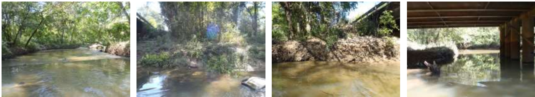
Photo group 1b: Site BF01 at 150m; downstream, left bank, right bank, upstream. Taken on trip 2, 10/06/2020.