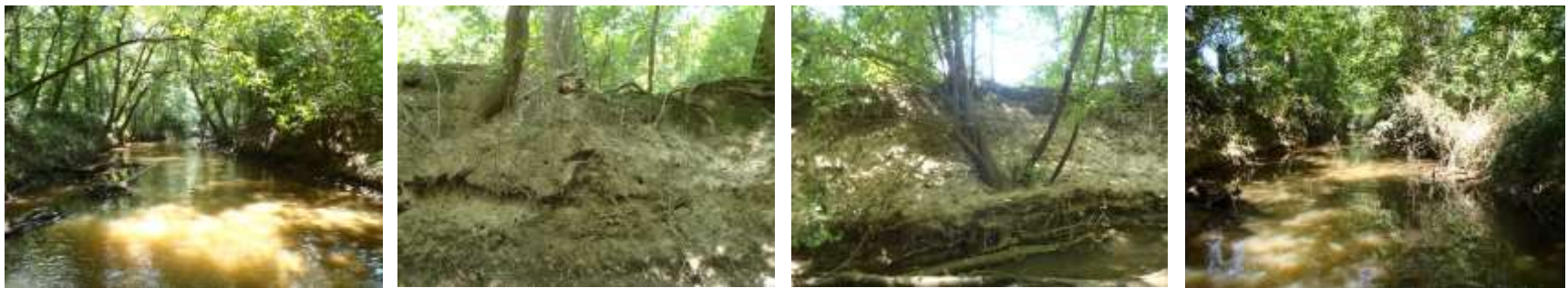
Photo group 2c: Site BF02 at 300m; downstream, left bank, right bank, upstream. Taken on trip 1, 08/03/2020.