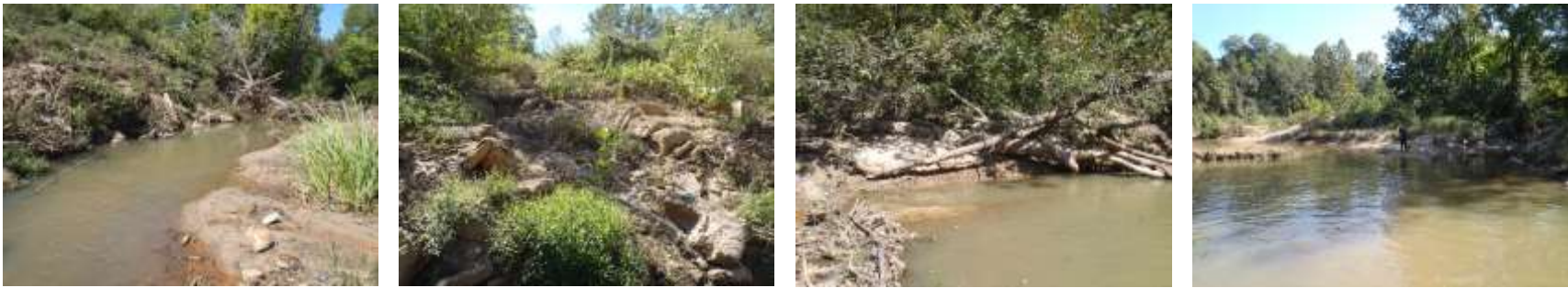
Photo group 5a: Site BF05 at 0m; downstream, left bank, right bank, upstream. Taken on trip 2, 10/06/2020.