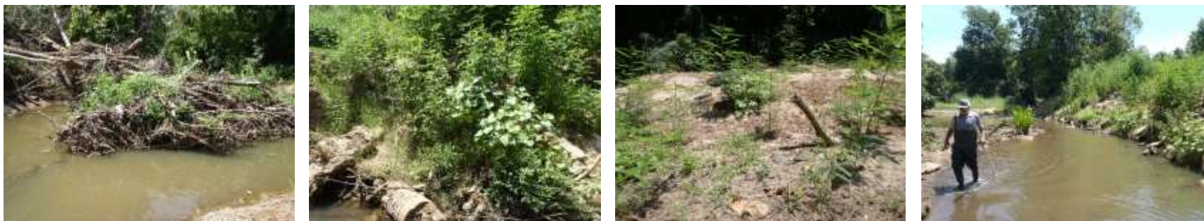
Photo group 5a: Site BF05 at 0m; downstream, left bank, right bank, upstream. Taken on trip 1, 08/03/2020.