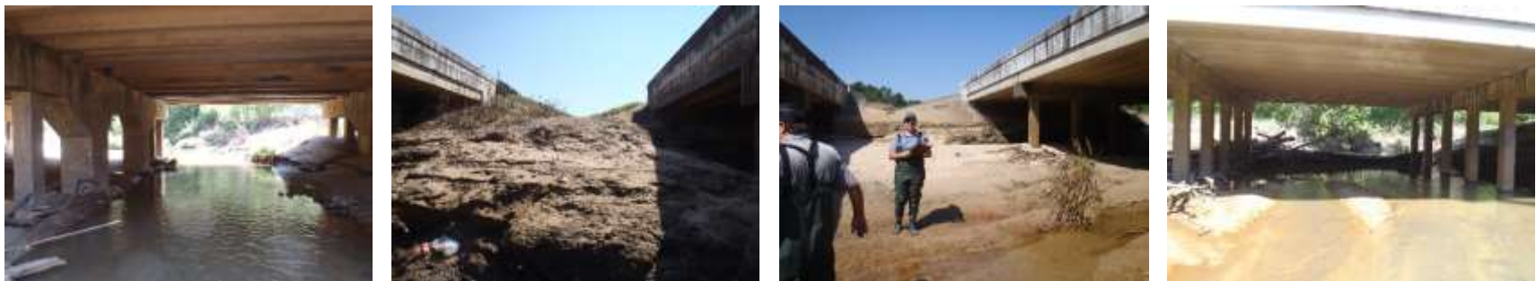
Photo group 4b: Site BF04 at 150m; downstream, left bank, right bank, upstream. Taken on trip 2, 10/06/2020.