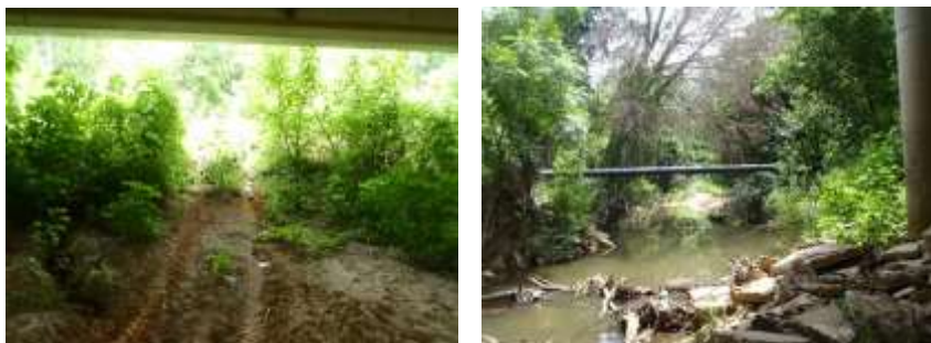
Photo group 6d: Site BF06; ATV tracks and pipeline. Taken on trip 1, 08/03/2020.