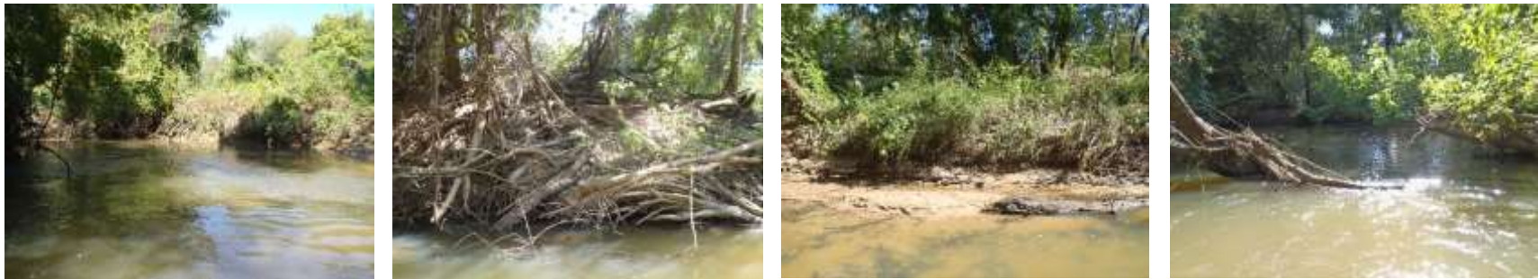
Photo group 1a: Site BF01 at 0m; downstream, left bank, right bank, upstream. Taken on trip 2, 10/06/2020.