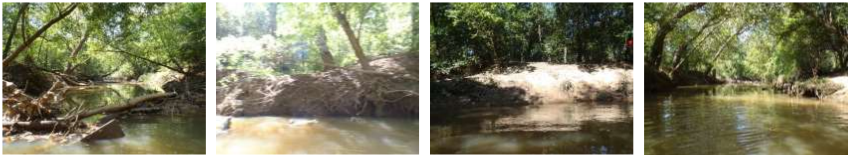
Photo group 3a: Site BF03 at 0m; downstream, left bank, right bank, upstream. Taken on trip 2, 10/06/2020.