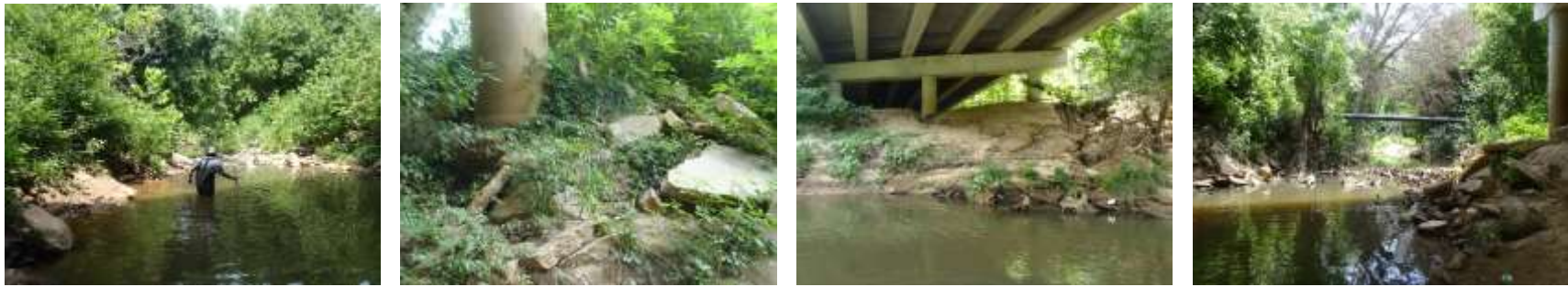
Photo group 6a: Site BF06 at 0m; downstream, left bank, right bank, upstream. Taken on trip 1, 08/03/2020.