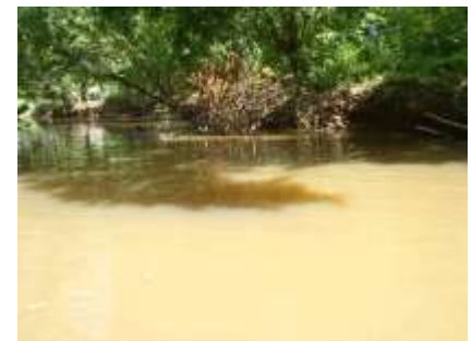
Photo group 3b: Site BF03 at 150m; downstream, left bank, right bank, upstream. Taken on trip 1, 08/03/2020.