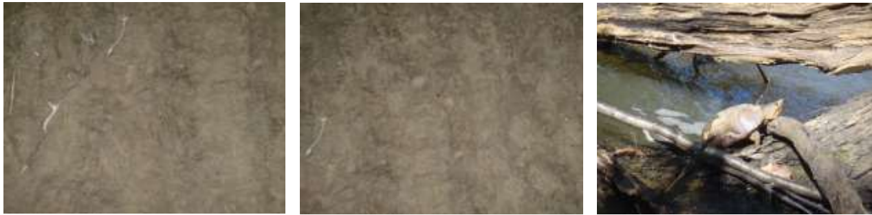
Photo group 1d: Site BF01; alligator tracks and snapping turtle. Taken on trip 2, 10/06/2020.