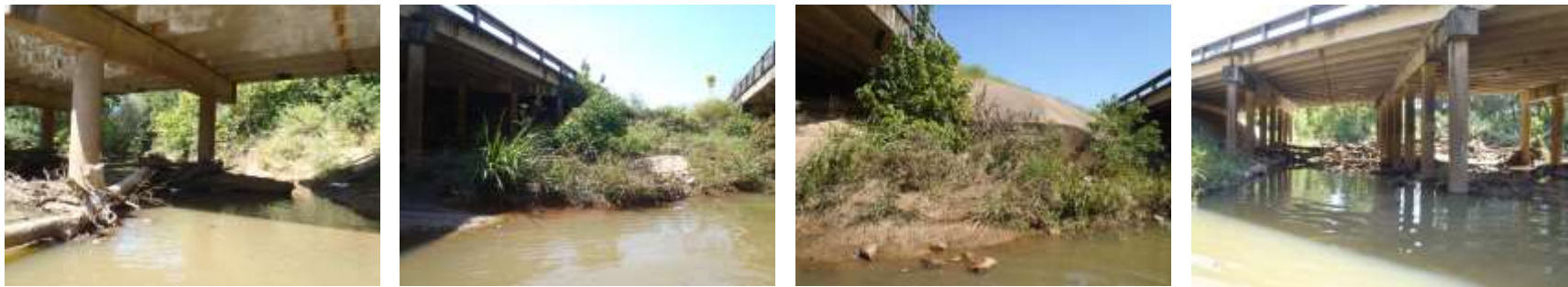
Photo group 5c: Site BF05 at 300m; downstream, left bank, right bank, upstream. Taken on trip 2, 10/06/2020.