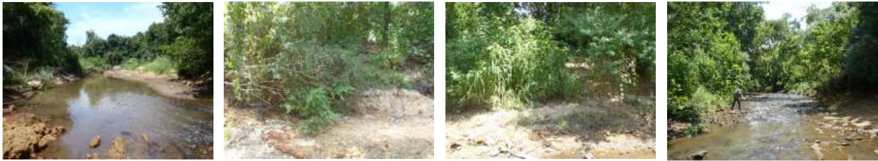
Photo group 5b: Site BF05 at 150m; downstream, left bank, right bank, upstream. Taken on trip 1, 08/03/2020.