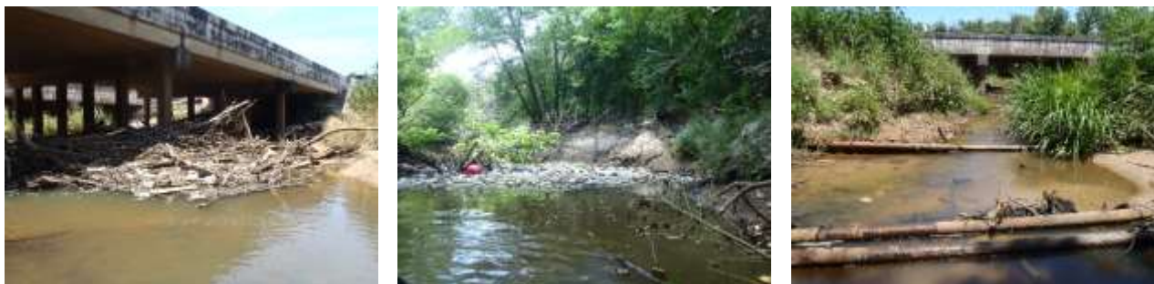
Photo group 4d: Site BF04; debris pile 1, debris pile 2, pipelines. Taken on trip 1, 08/03/2020.