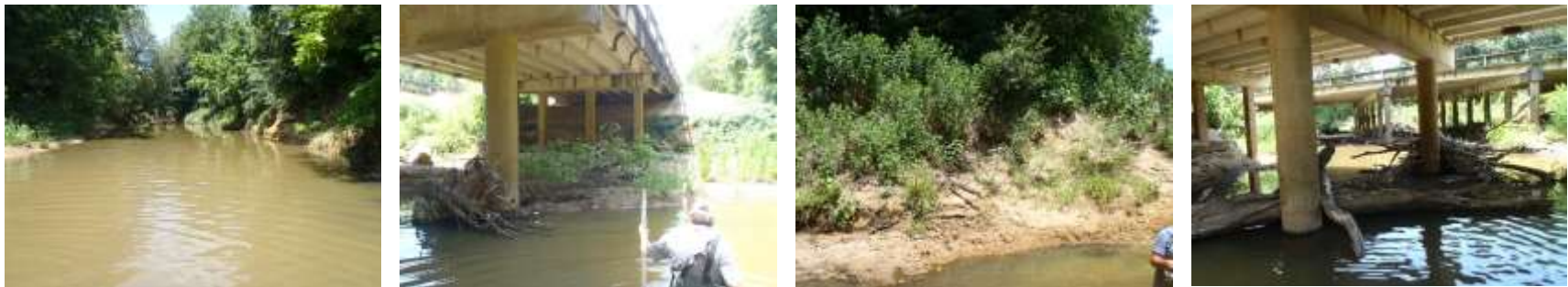
Photo group 5c: Site BF05 at 300m; downstream, left bank, right bank, upstream. Taken on trip 1, 08/03/2020.