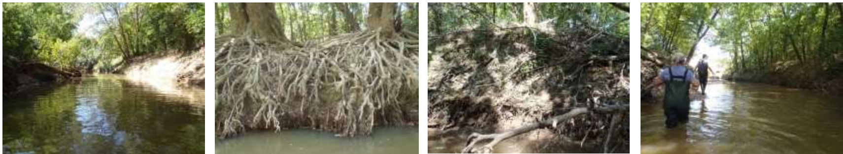
Photo group 4a: Site BF04 at 0m; downstream, left bank, right bank, upstream. Taken on trip 2, 10/06/2020.