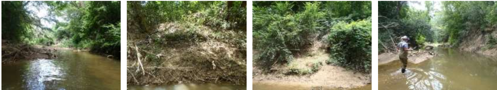
Photo group 6b: Site BF06 at 150m; downstream, left bank, right bank, upstream. Taken on trip 1, 08/03/2020.