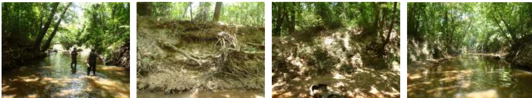
Photo group 4c: Site BF04 at 300m; downstream, left bank, right bank, upstream. Taken on trip 1, 08/03/2020.