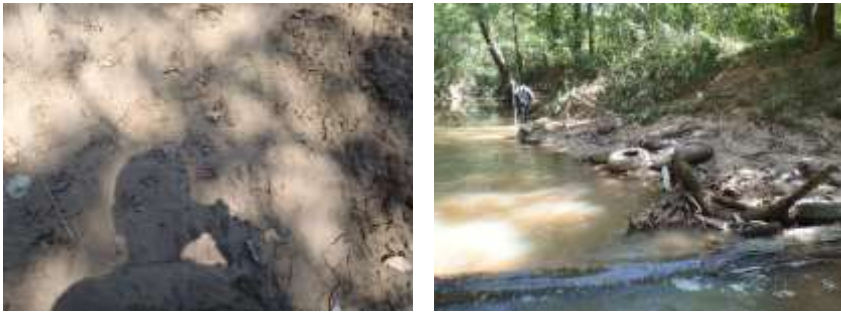
Photo group 4d: Site BF04; alligator tracks and tires. Taken on trip 2, 10/06/2020.