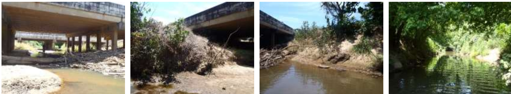
Photo group 4b: Site BF04 at 150m; downstream, left bank, right bank, upstream. Taken on trip 1, 08/03/2020.