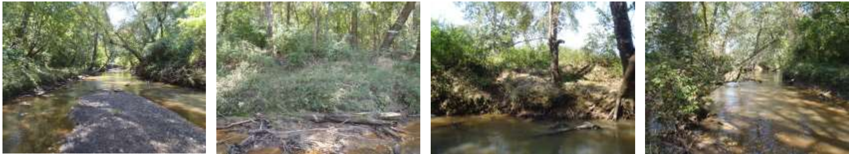
Photo group 2a: Site BF02 at 0m; downstream, left bank, right bank, upstream. Taken on trip 2, 10/06/2020.