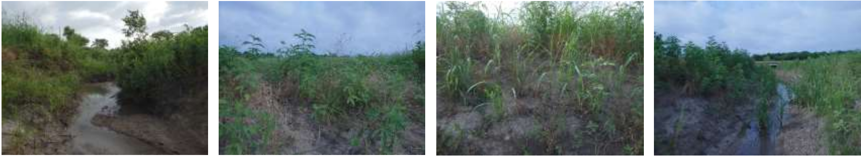
Photo group 4c: Site HG04 at 300m; downstream, left bank, right bank, upstream. Taken on trip 1, 06/23/2021.