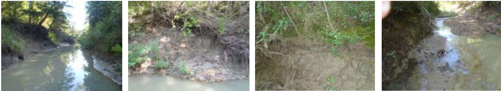
Photo group 2a: Site HG02 at 0m; downstream, left bank, right bank, upstream. Taken on trip 2, 08/25/2021.