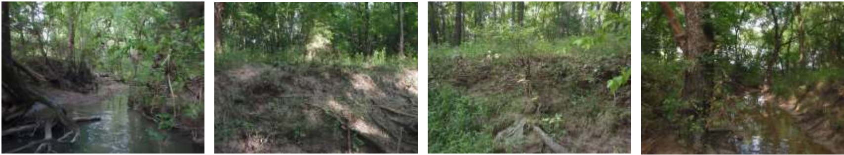
Photo group 3c: Site HG03 at 300m; downstream, left bank, right bank, upstream. Taken on trip 1, 06/23/2021.