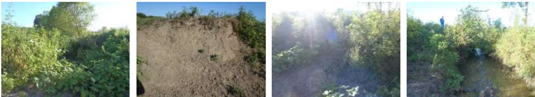
Photo group 4b: Site HG04 at 150m; downstream, left bank, right bank, upstream. Taken on trip 2, 08/25/2021.