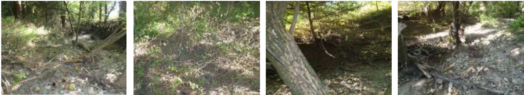
Photo group 3a: Site HG03 at 0m; downstream, left bank, right bank, upstream. Taken on trip 2, 08/25/2021.