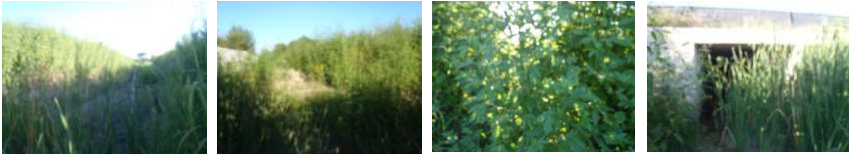
Photo group 4c: Site HG04 at 300m; downstream, left bank, right bank, upstream. Taken on trip 2, 08/25/2021.