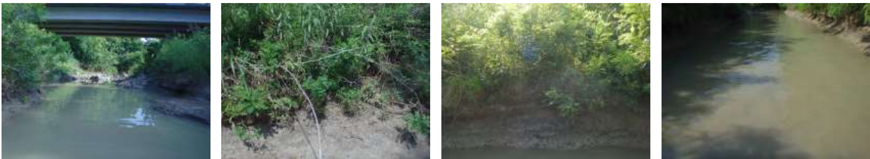
Photo group 2b: Site HG02 at 150m; downstream, left bank, right bank, upstream. Taken on trip 1, 06/23/2021.