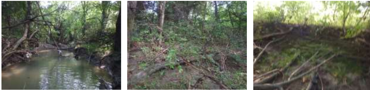
Photo group 3a: Site HG03 at 0m; downstream, left bank, right bank. Taken on trip 1, 06/23/2021.