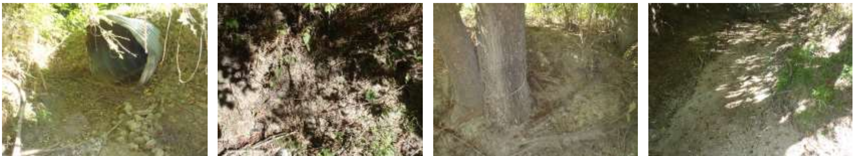
Photo group 3b: Site HG03 at 150m; downstream, left bank, right bank, upstream. Taken on trip 2, 08/25/2021.