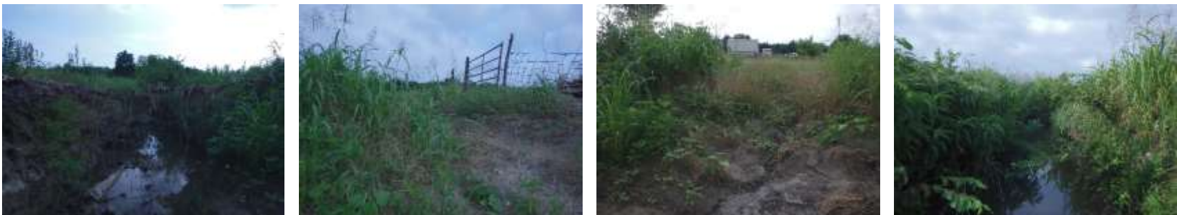
Photo group 4b: Site HG04 at 150m; downstream, left bank, right bank, upstream. Taken on trip 1, 06/23/2021.