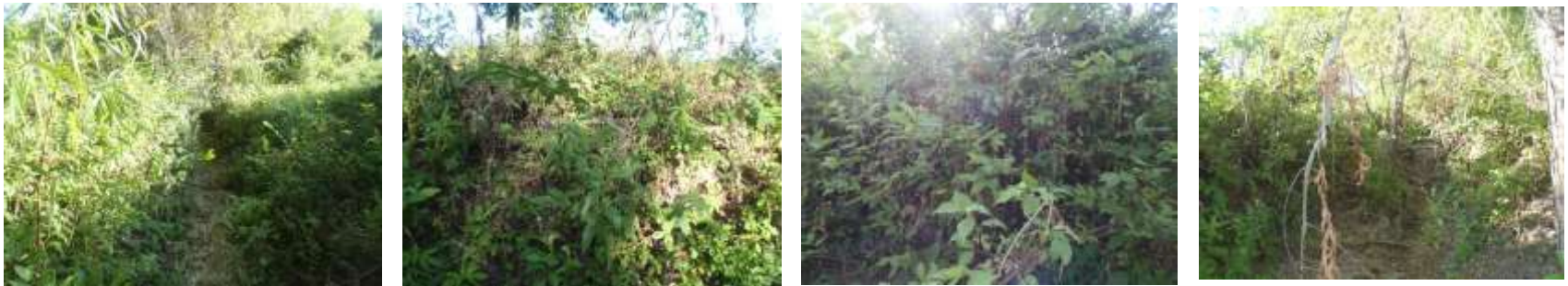
Photo group 4a: Site HG04 at 0m; downstream, left bank, right bank, upstream. Taken on trip 2, 08/25/2021.