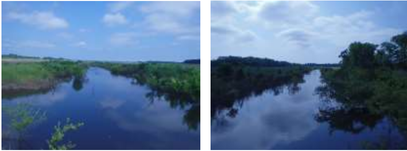
Photo group 1a: Site HG01; downstream, upstream. Taken on trip 1, 06/23/2021.