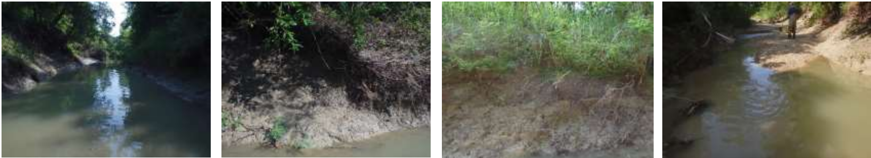
Photo group 2a: Site HG02 at 0m; downstream, left bank, right bank, upstream. Taken on trip 1, 06/23/2021.