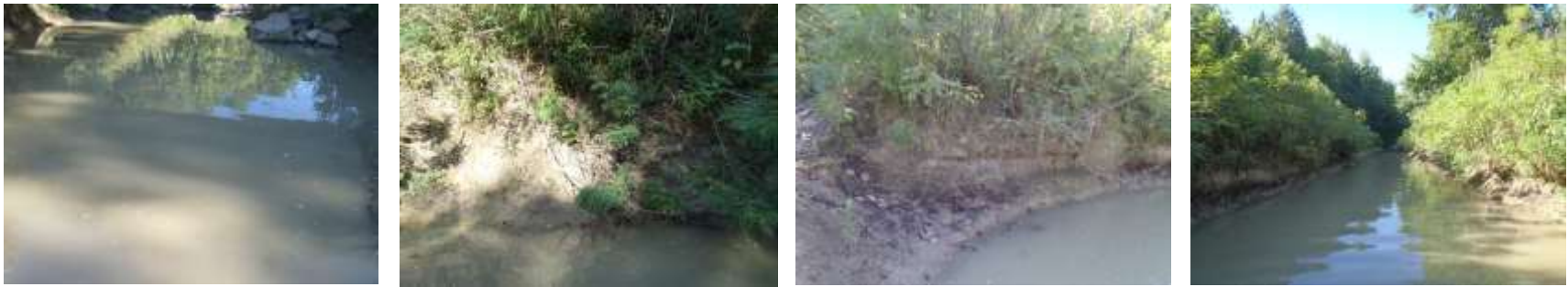
Photo group 2c: Site HG02 at 300m; downstream, left bank, right bank, upstream. Taken on trip 2, 08/25/2021.