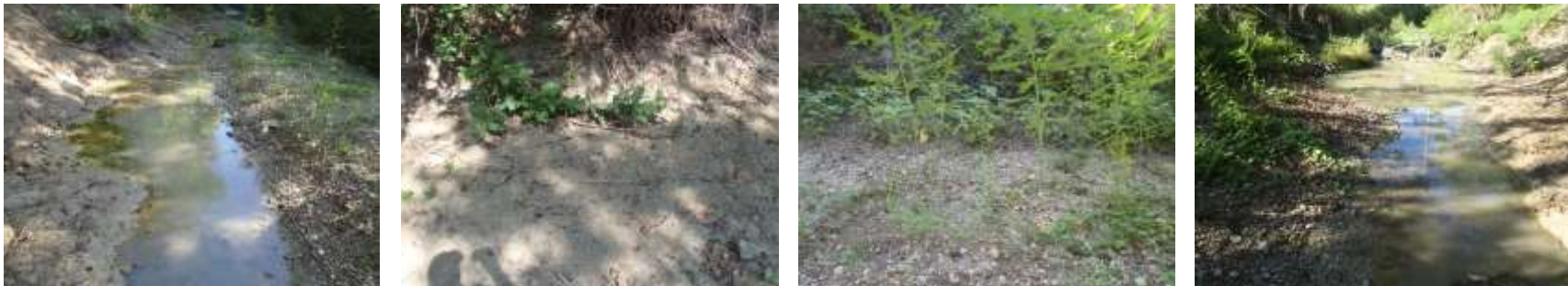
Photo group 2b: Site HG02 at 150m; downstream, left bank, right bank, upstream. Taken on trip 2, 08/25/2021.