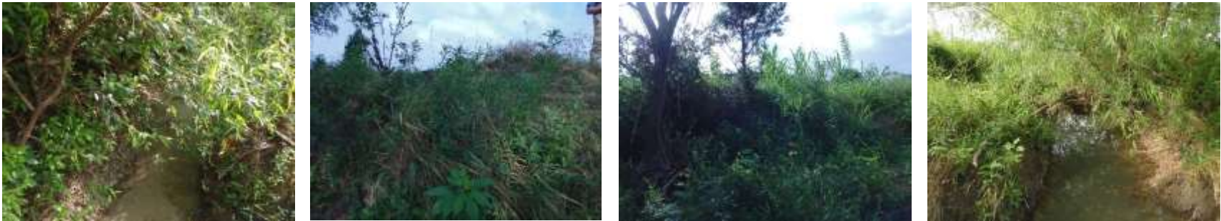
Photo group 4a: Site HG04 at 0m; downstream, left bank, right bank, upstream. Taken on trip 1, 06/23/2021.