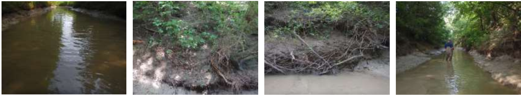
Photo group 2c: Site HG02 at 300m; downstream, left bank, right bank, upstream. Taken on trip 1, 06/23/2021.