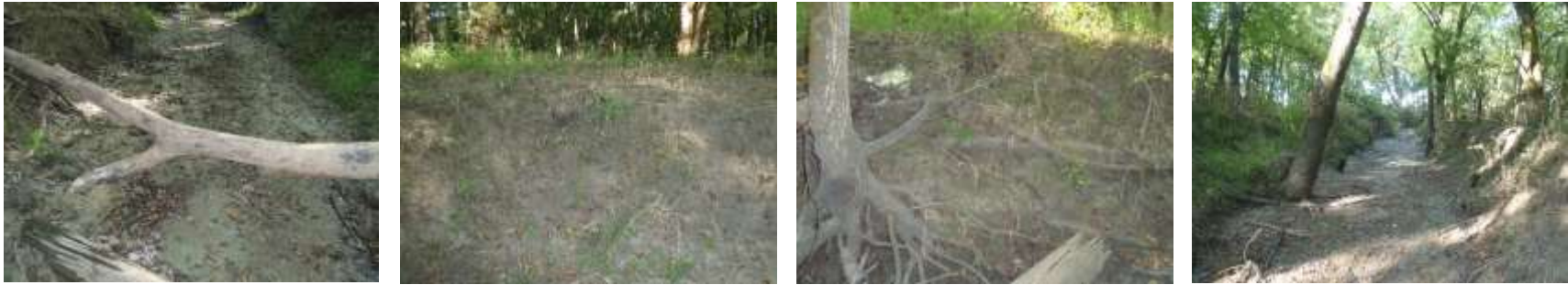
Photo group 3c: Site HG03 at 300m; downstream, left bank, right bank, upstream. Taken on trip 2, 08/25/2021.