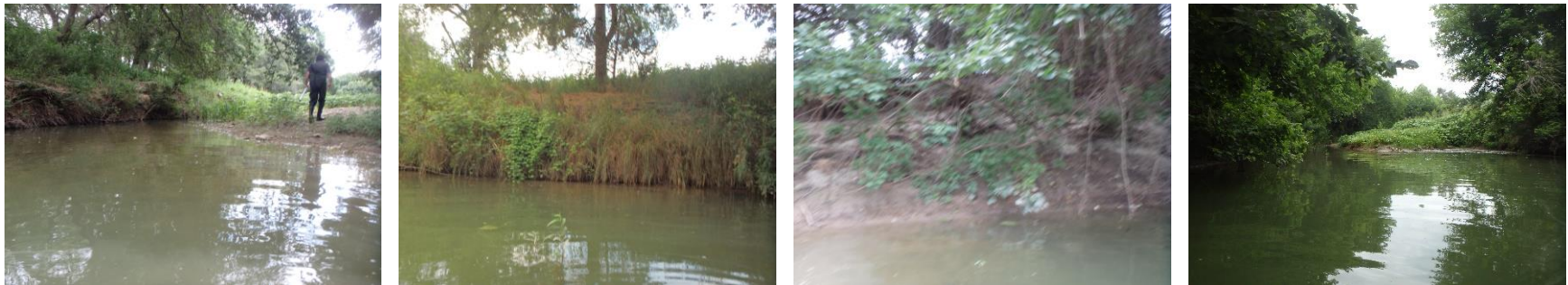
Photo group 5c: Site AC05 at 300m: From Left to Right; downstream, left bank, right bank, upstream. Taken on trip 1, 6/20/2024.