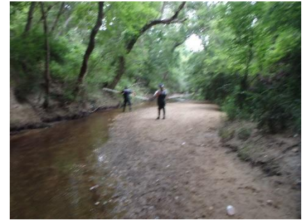
Photo group 3b: Site AC03 at 150m: From Left to Right; downstream, left bank, right bank, upstream. Taken on trip 1, 6/20/2024.