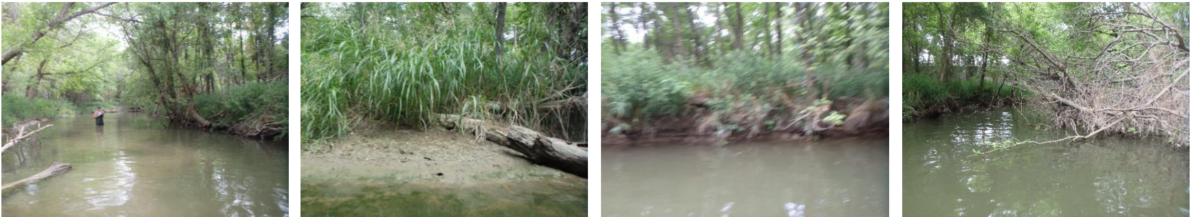
Photo group 1b: Site AC01 at 150m: From Left to Right; downstream, left bank, right bank, upstream. Taken on trip 1, 6/20/2024.