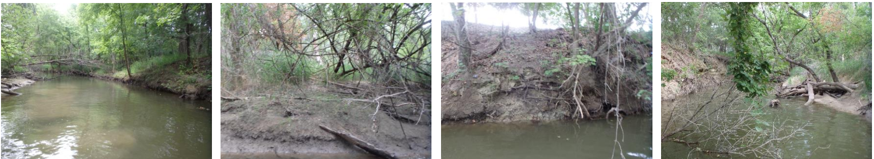
Photo group 1c: Site AC01 at 300m: From Left to Right; downstream, left bank, right bank, upstream. Taken on trip 1, 6/20/2024.