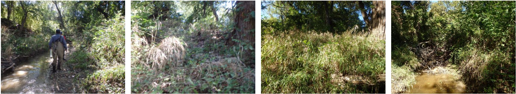
Photo group 12b: Site AC09 at 150m: From Left to Right; downstream, left bank, right bank, upstream. Taken on trip 2, 9/26/2024.