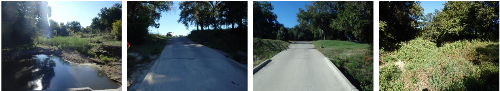
Photo group 12b: Site AC05 at 150m: From Left to Right; downstream, left bank, right bank, upstream. Taken on trip 2, 9/26/2024.