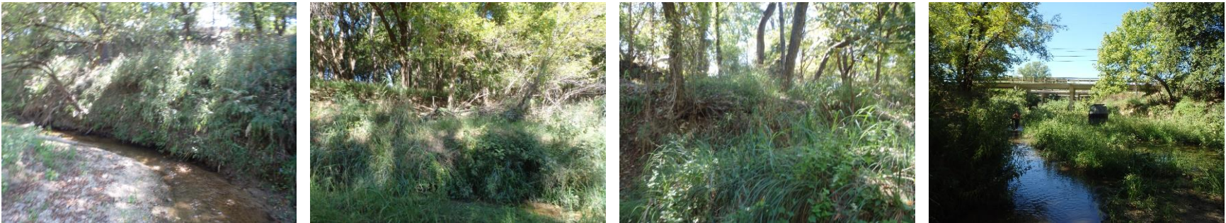
Photo group 9b: Site AC02 at 150m: From Left to Right; downstream, left bank, right bank, upstream. Taken on trip 2, 9/25/2024.