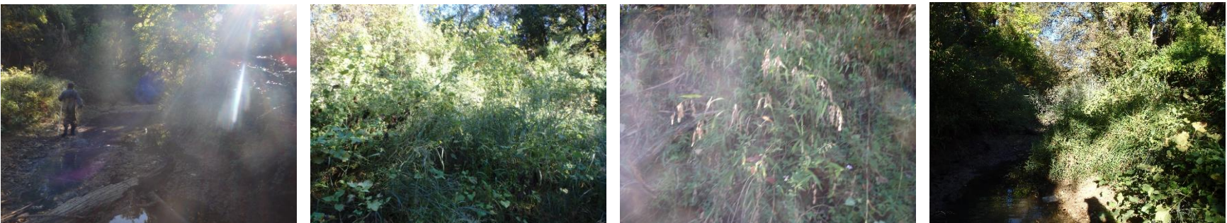
Photo group 11c: Site AC04 at 300m: From Left to Right; downstream, left bank, right bank, upstream. Taken on trip 2, 9/26/2024.