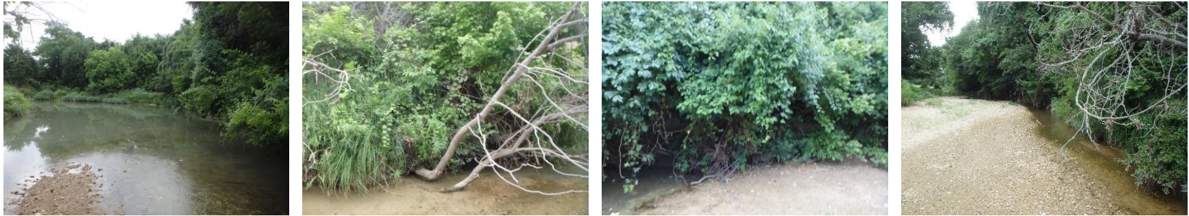
Photo group 5a: Site AC05 at 0m: From Left to Right; downstream, left bank, right bank, upstream. Taken on trip 1, 6/20/2024.