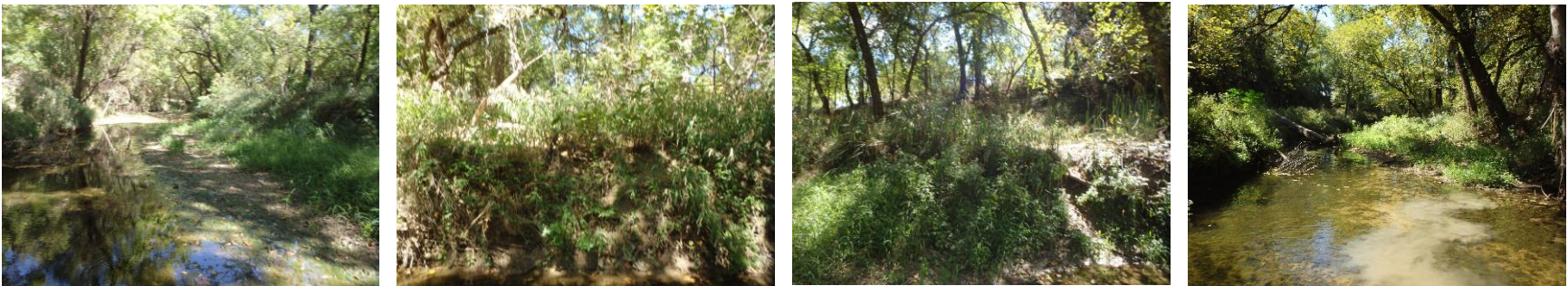
Photo group 9c: Site AC02 at 300m: From Left to Right; downstream, left bank, right bank, upstream. Taken on trip 2, 9/25/2024.