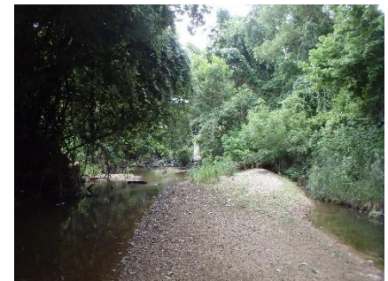
Photo group 4c: Site AC04 at 300m: From Left to Right; downstream, left bank, right bank, upstream. Taken on trip 1, 6/20/2024.