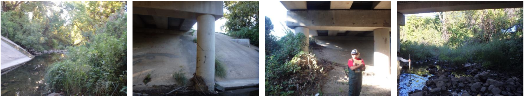
Photo group 11a: Site AC04 at 0m: From Left to Right; downstream, left bank, right bank, upstream. Taken on trip 2, 9/26/2024.