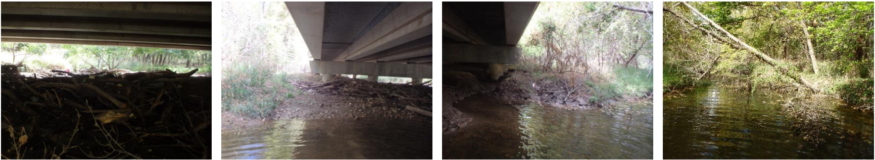
Photo group 8a: Site AC01 at 0m: From Left to Right; downstream, left bank, right bank, upstream. Taken on trip 2, 9/25/2024.