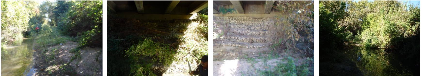
Photo group 12b: Site AC07 at 150m: From Left to Right; downstream, left bank, right bank, upstream. Taken on trip 2, 9/26/2024.