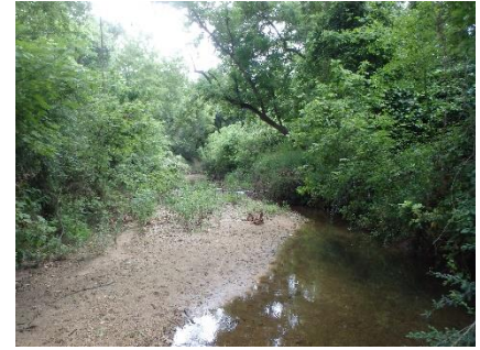
Photo group 3a: Site AC03 at 0m: From Left to Right; downstream, left bank, right bank, upstream. Taken on trip 1, 6/20/2024.