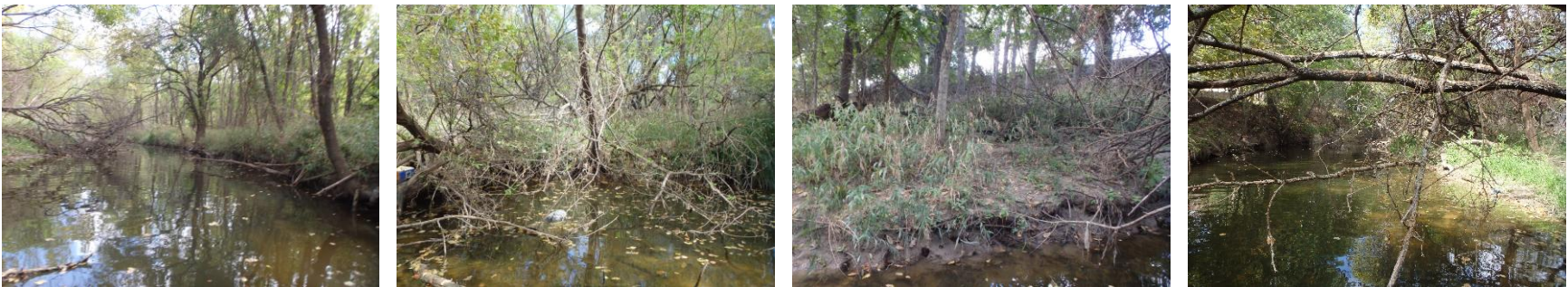
Photo group 8b: Site AC01 at 150m: From Left to Right; downstream, left bank, right bank, upstream. Taken on trip 2, 9/25/2024.