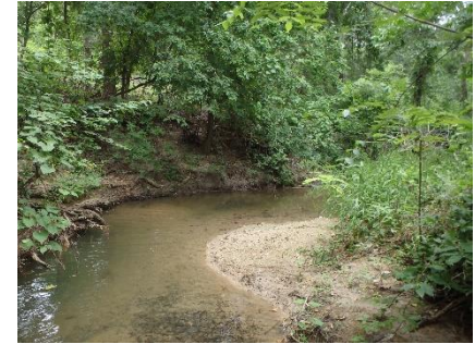
Photo group 7a: Site AC09 at 0m: From Left to Right; downstream, left bank, right bank, upstream. Taken on trip 1, 6/20/2024.