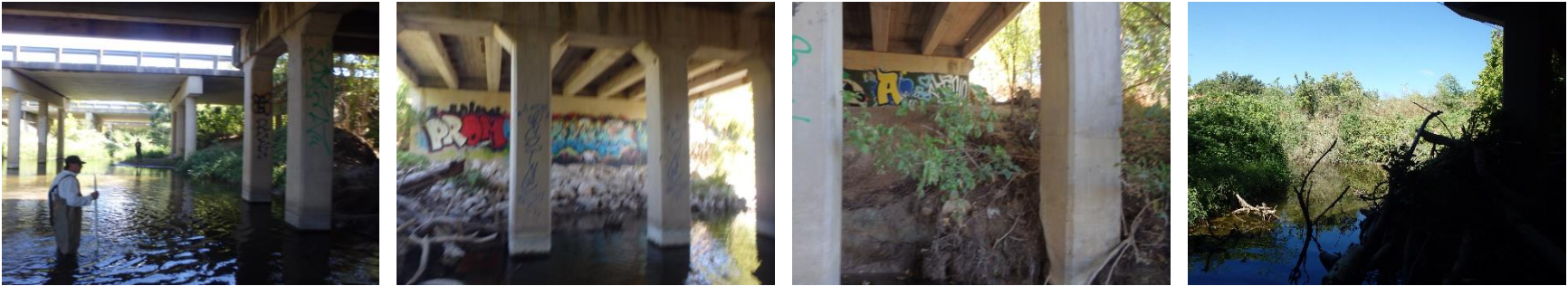
Photo group 9a: Site AC02 at 0m: From Left to Right; downstream, left bank, right bank, upstream. Taken on trip 2, 9/25/2024.