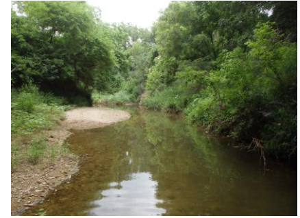
Photo group 4a: Site AC04 at 0m: From Left to Right; downstream, left bank, right bank, upstream. Taken on trip 1, 6/20/2024.