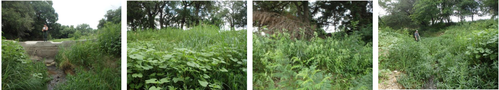
Photo group 5b: Site AC05 at 150m: From Left to Right; downstream, left bank, right bank, upstream. Taken on trip 1, 6/20/2024.