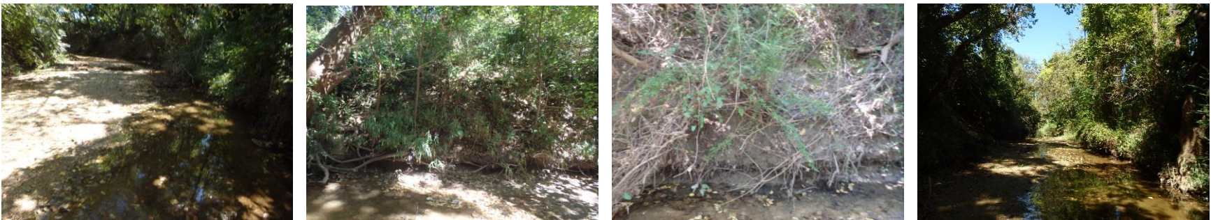
Photo group 10c: Site AC03 at 300m: From Left to Right; downstream, left bank, right bank, upstream. Taken on trip 2, 9/25/2024.