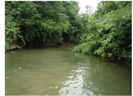
Photo group 4b: Site AC04 at 150m: From Left to Right; downstream, left bank, right bank, upstream. Taken on trip 1, 6/20/2024.