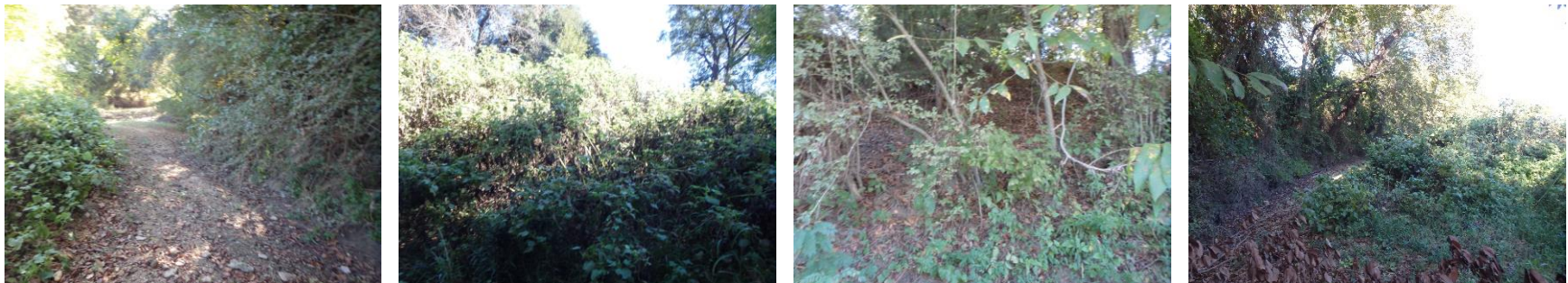
Photo group 12c: Site AC05 at 300m: From Left to Right; downstream, left bank, right bank, upstream. Taken on trip 2, 9/26/2024.