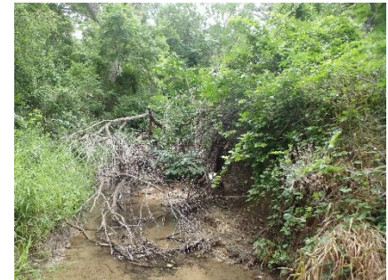
Photo group 7b: Site AC09 at 150m: From Left to Right; downstream, left bank, right bank, upstream. Taken on trip 2, 6/20/2024.