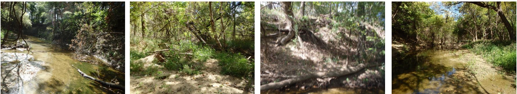
Photo group 8c: Site AC01 at 300m: From Left to Right; downstream, left bank, right bank, upstream. Taken on trip 2, 9/25/2024.