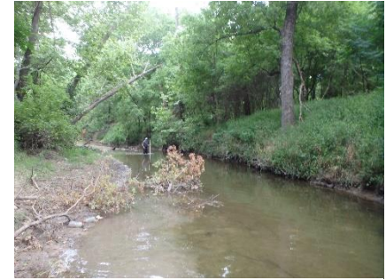
Photo group 2a: Site AC02 at 0m: From Left to Right; downstream, left bank, right bank, upstream. Taken on trip 1, 6/20/2024.