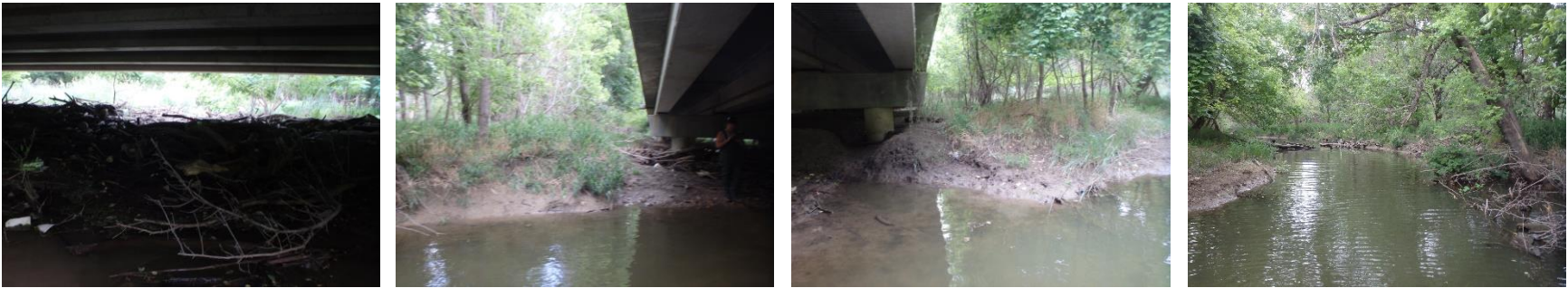
Photo group 1a: Site AC01 at 0m: From Left to Right; downstream, left bank, right bank, upstream. Taken on trip 1, 6/20/2024.