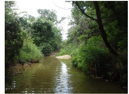
Photo group 6b: Site AC07 at 150m: From Left to Right; downstream, left bank, right bank, upstream. Taken on trip 1, 6/20/2024.