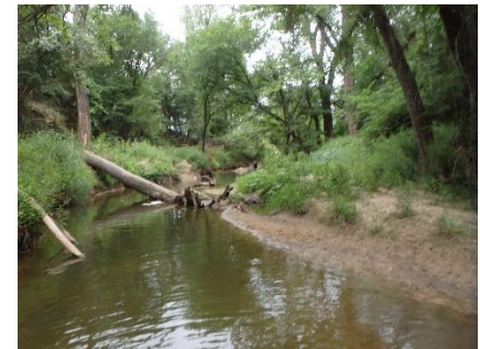
Photo group 2b: Site AC02 at 150m: From Left to Right; downstream, left bank, right bank, upstream. Taken on trip 1, 6/20/2024.