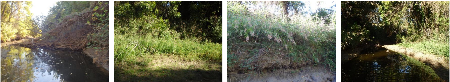
Photo group 11b: Site AC04 at 150m: From Left to Right; downstream, left bank, right bank, upstream. Taken on trip 2, 9/26/2024.