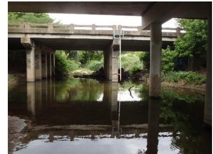
Photo group 2c: Site AC02 at 300m: From Left to Right; downstream, left bank, right bank, upstream. Taken on trip 1, 6/20/2024.