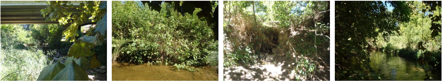
Photo group 10a: Site AC03 at 0m: From Left to Right; downstream, left bank, right bank, upstream. Taken on trip 2, 9/25/2024.