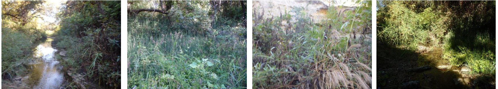
Photo group 12a: Site AC07 at 0m: From Left to Right; downstream, left bank, right bank, upstream. Taken on trip 2, 9/26/2024.