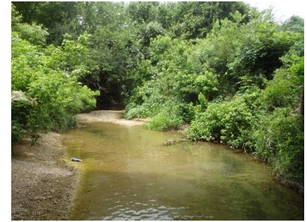
Photo group 6a: Site AC07 at 0m: From Left to Right; downstream, left bank, right bank, upstream. Taken on trip 1, 6/20/2024.