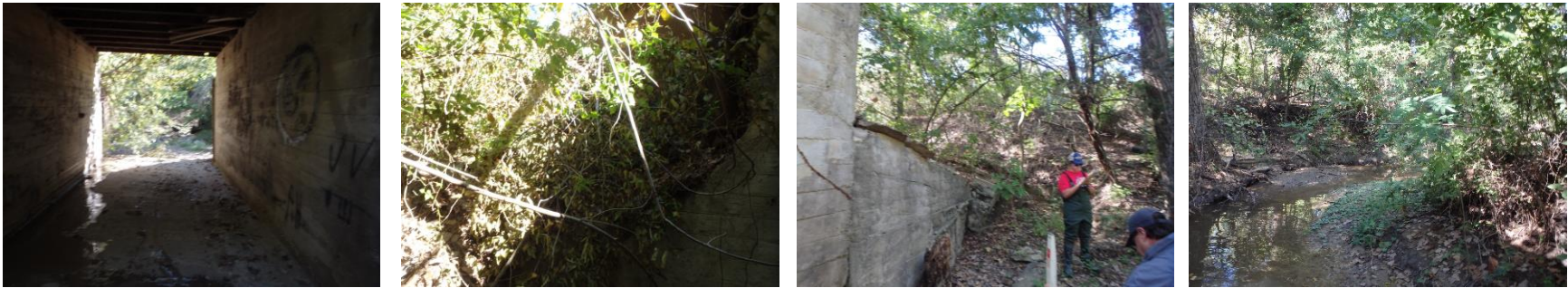
Photo group 12a: Site AC09 at 0m: From Left to Right; downstream, left bank, right bank, upstream. Taken on trip 2, 9/26/2024.