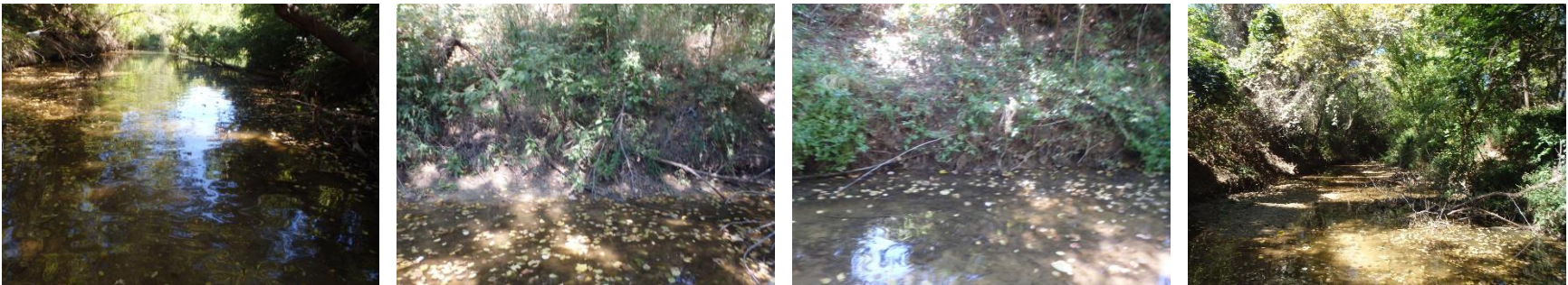
Photo group 10b: Site AC03 at 150m: From Left to Right; downstream, left bank, right bank, upstream. Taken on trip 2, 9/25/2024.