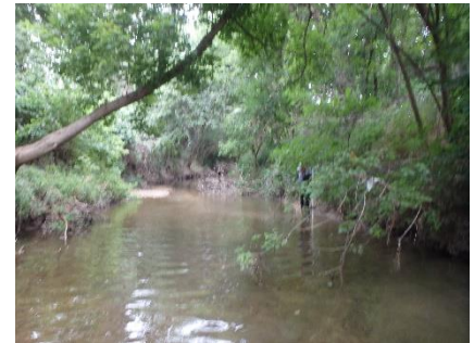
Photo group 3c: Site AC03 at 300m: From Left to Right; downstream, left bank, right bank, upstream. Taken on trip 1, 6/20/2024.