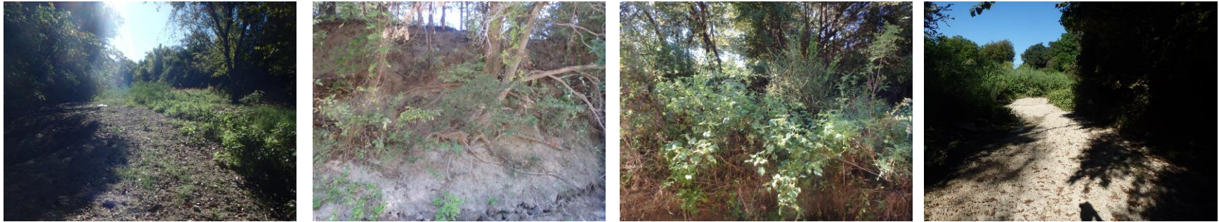
Photo group 12a: Site AC05 at 0m: From Left to Right; downstream, left bank, right bank, upstream. Taken on trip 2, 9/26/2024.