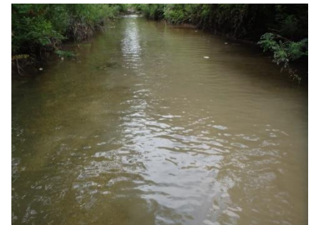
Photo group 6c: Site AC07 at 300m: From Left to Right; downstream, left bank, right bank, upstream. Taken on trip 1, 6/20/2024.