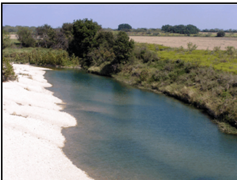
The Lower Sabinal River at the crossing of State Highway 127

The document was adopted by the commission on August 10, 2005. Upon EPA approval, the TMDL will become an update to the state Water Quality Management Plan.