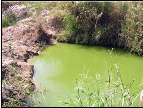
Oxidation pond at the Sabinal WWTF

Nitrogen compounds, such as nitrate, nitrite, and ammonia, are common components of all effluent streams discharged from municipal WWTFs. Often, ammonia-nitrogen is regulated by a limit in the discharge permit. Also, nitrogen compounds are some of the main ingredients in agricultural and lawn fertilizers, which is why they are commonly found in storm water runoff from urban and agricultural production areas.