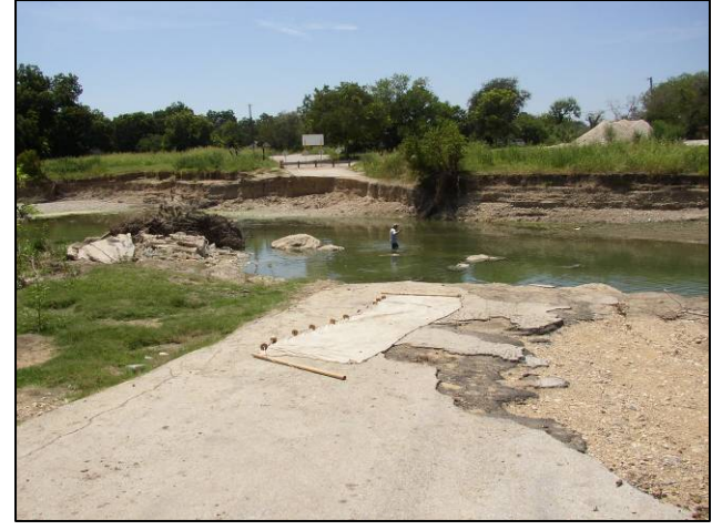
Figure 3. Station 12924

sections of the Receiving Water Assessment (RWA) Procedures Manual (Texas Natural Resource Conservation Commission [TNRCC] 1999b). As specified in the RWA manual, EComm evaluated fish sampled in accordance with statewide criteria of Indices of Biotic Integrity (IBIs). Additionally, EComm generated IBIs for all stations using regional criteria developed by Texas Parks and Wildlife Department (2002). The regional criteria consider differences in landforms, soil types, climatic conditions, vegetation, and zoogeographic factors among the ecoregions and thus "provide a better representation of the integrity of fish assemblage" as compared to statewide criteria.