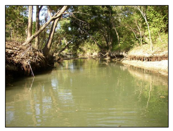
Figure 1. Station 12927

In 2000 the Texas Commission on Environmental Quality (TCEQ) initiated a study to investigate water quality impairments in 11 water bodies in Basin Groups D & E identified through the 1999 305(b) Water Quality Inventory as part of a total daily maximum load (TMDL) program. The segments were included on the 1999 State of Texas Clean Water Act 303(d) list as impaired due to concentrations of dissolved oxygen or bacteria or both which exceed established criteria. One of these water bodies was Middle Cibolo Creek (Segment 1913). The impairment to Segment 1913 was caused by depressed dissolved oxygen levels as indicated by data collected through the statewide