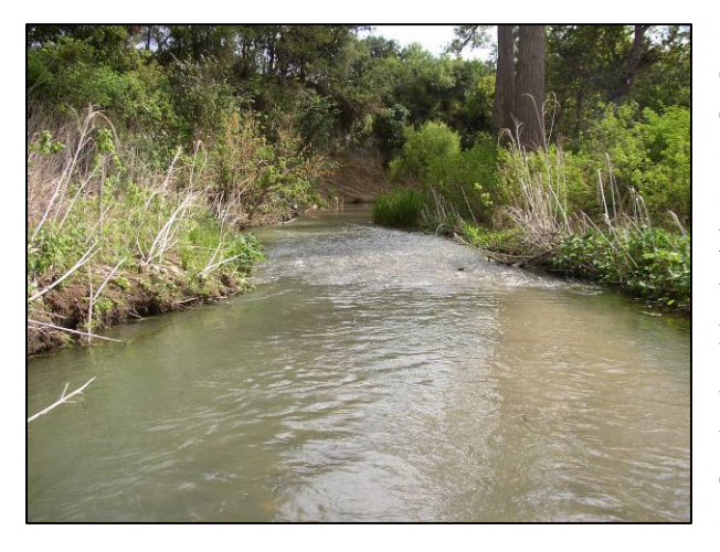
Figure 4. Station 12921

In addition to data collection via RWA guidelines and TCEQ Surface Water Quality Monitoring (SWQM) Procedures Manual (TNRCC 1999a), EComm captured data for approximately 14 previously uncoded biological and habitat parameters. These parameters include: the various metrics used in determining regional IBI scores; the final scores for aquatic life use values for both statewide and regional IBI criteria; the final scores for Rapid Bioassessment Protocol (RBP) for benthic macroinvertebrates; and the final scores for Habitat Quality Indices (HQIs). All 14 parameters were assigned unique STORET codes in an effort to create maximum efficiency for data management. The new STORET codes and descriptions, along with other STORET codes captured for this segment, are provided in Table 1.